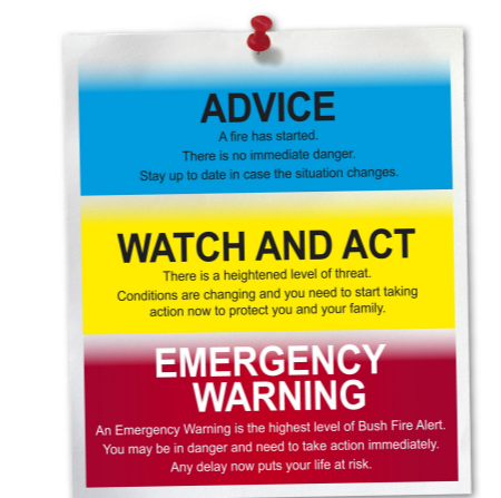
The Three Bush Fire Alert Levels.

NOTE: Impact areas have been prepared at a community level and are based on an Extreme Fire Danger Rating. Information provided on this map is not to be used for building / planning purposes.