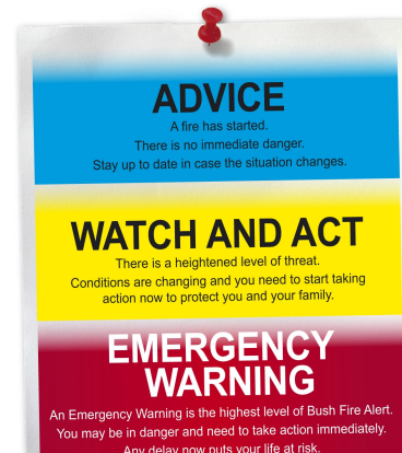
The Three Bush Fire Alert Levels.

NOTE: Impact areas have been prepared at a community level and are based on an Extreme Fire Danger Rating. Information provided on this map is not to be used for building / planning purposes.