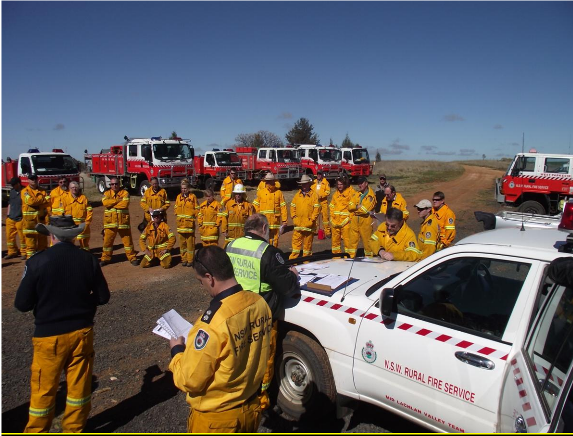
Getting a briefing before burning at Parkes