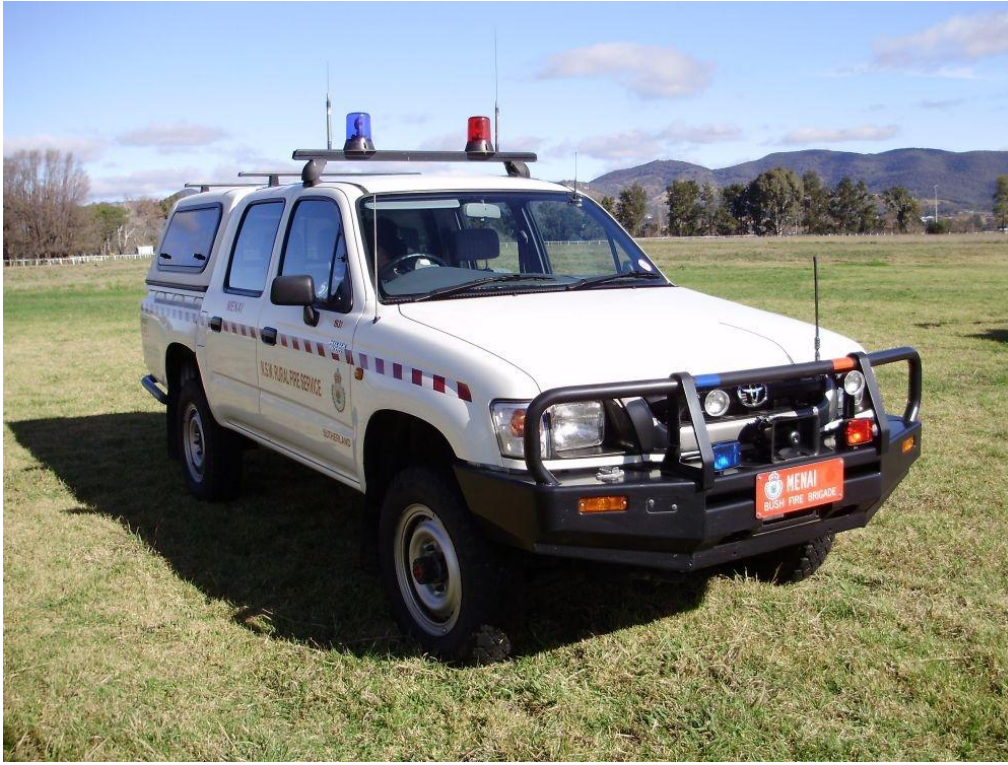
Lachlan 16 E acquired from Sutherland District