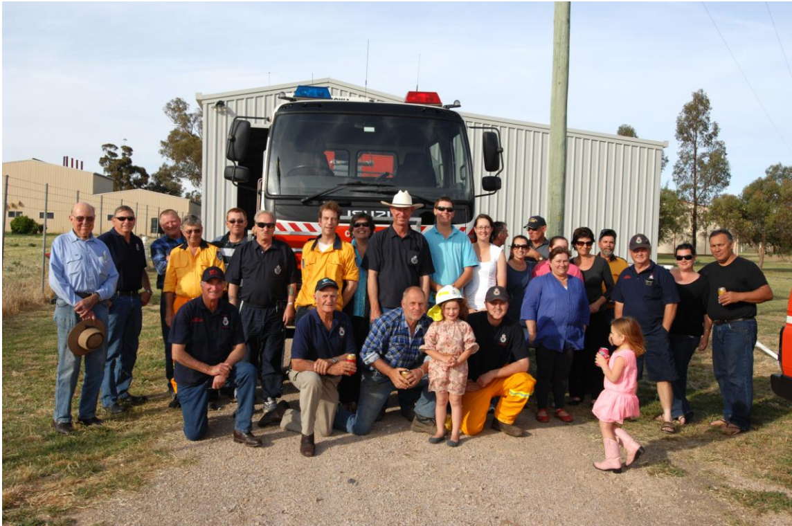
Volunteer members from Cumbijowa open their Station extensions