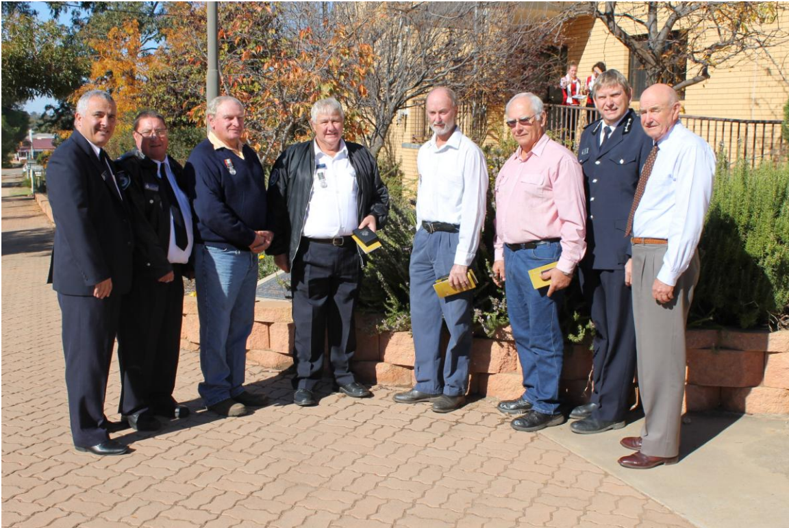
Baratta Brigade Members receive Long Service Medals for their efforts over many years