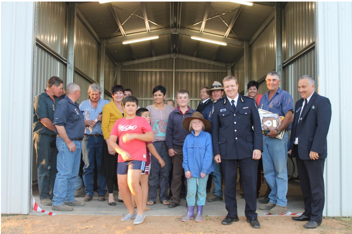
Long serving members of Monwonga RFB received awards and opened their new Station