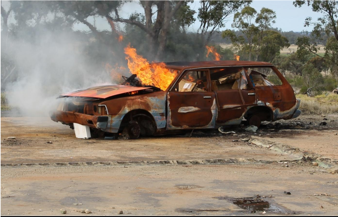
Village Fire Fighter Training Ground Condobolin