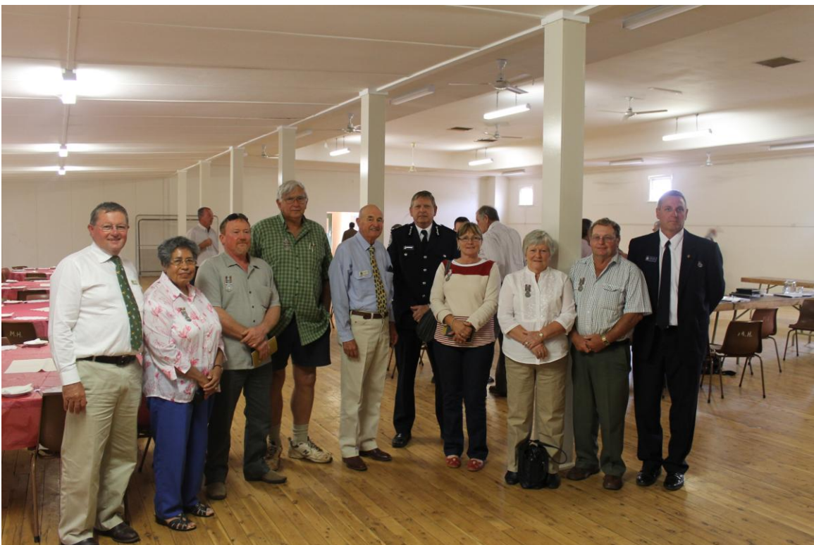
Members of Brewer/Bootawa RFB receive Long Service Medals