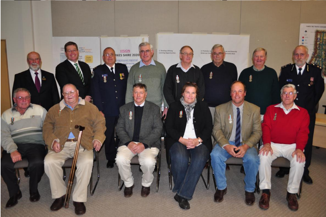
The Troffs and Tichbourne members received Long Service Medals at PSC