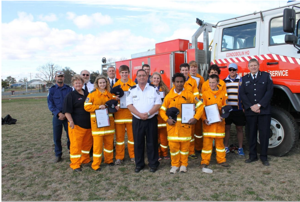
Condobolin Cadets with their Certificates after completing the Program