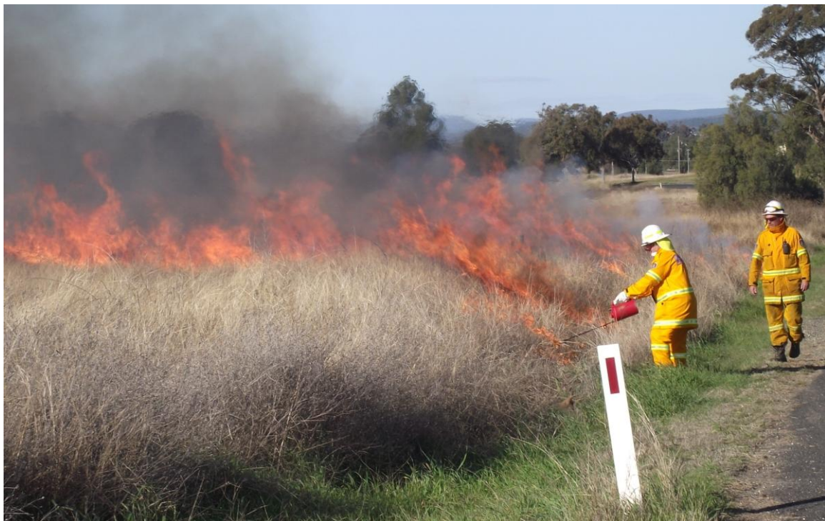
Getting rid of a heap of fuel at London Road