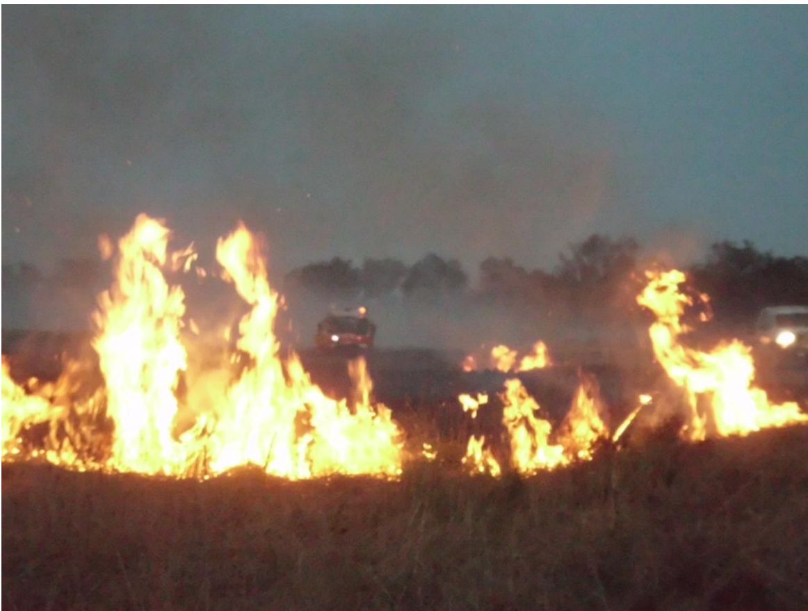
Burning blocks at Greenthorpe