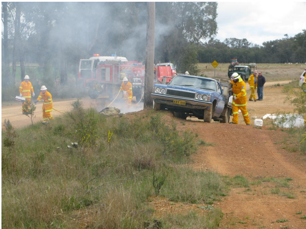
Crews Respond to a “Motor Vehicle Accident” at the Greenethorpe Exercise