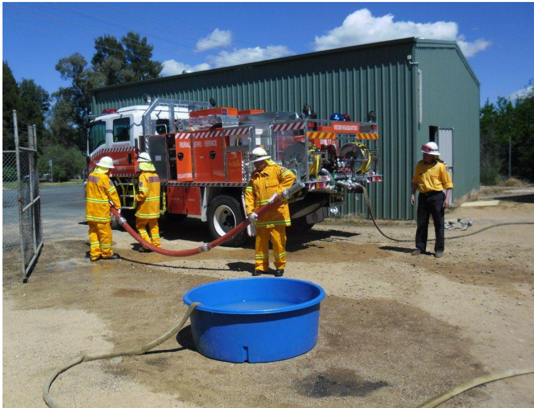
Members Practice their New Skills at Weddin Basic Fire Fighter Training