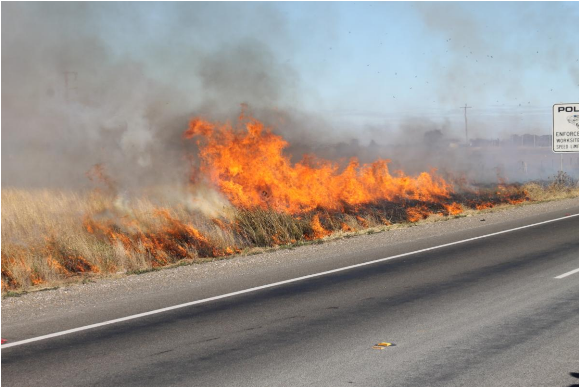
Roadside burning being undertaken along the Newell Highway in Back Yamma area