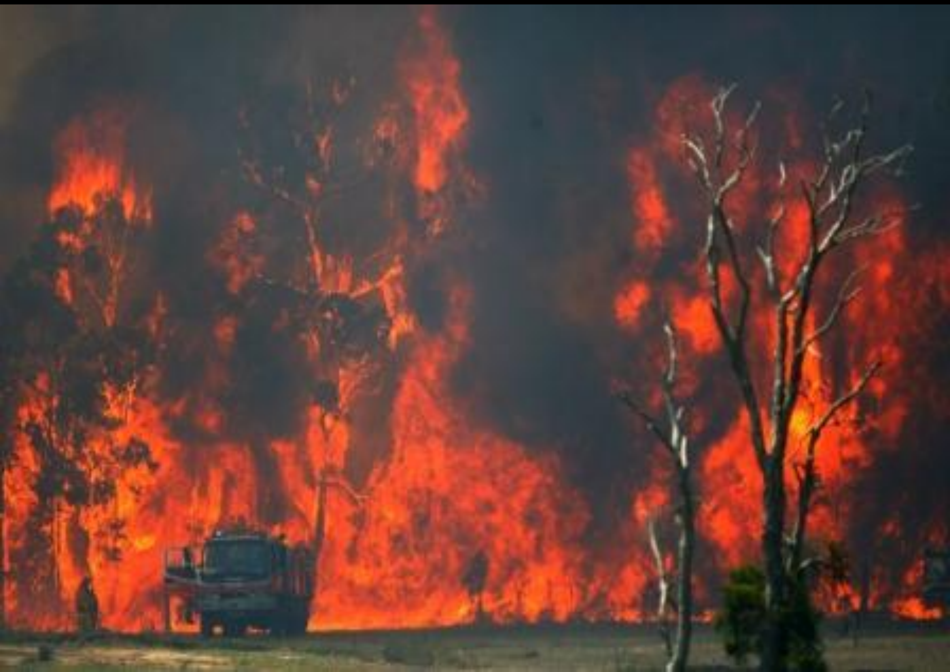
Aberdare fire (Cessnock LGA)