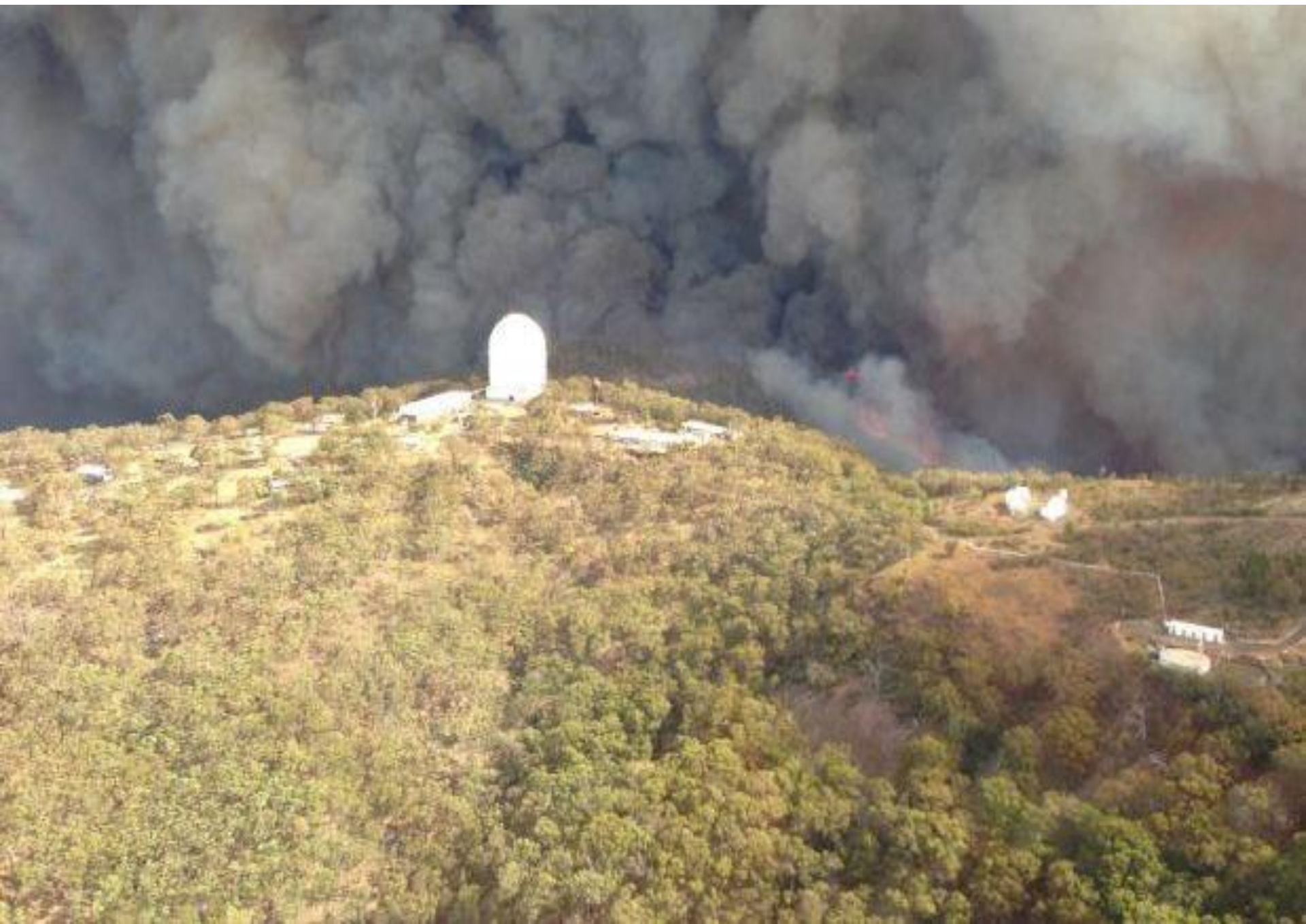
Wambelong fire (Warrumbungle & Coonamble LGA)