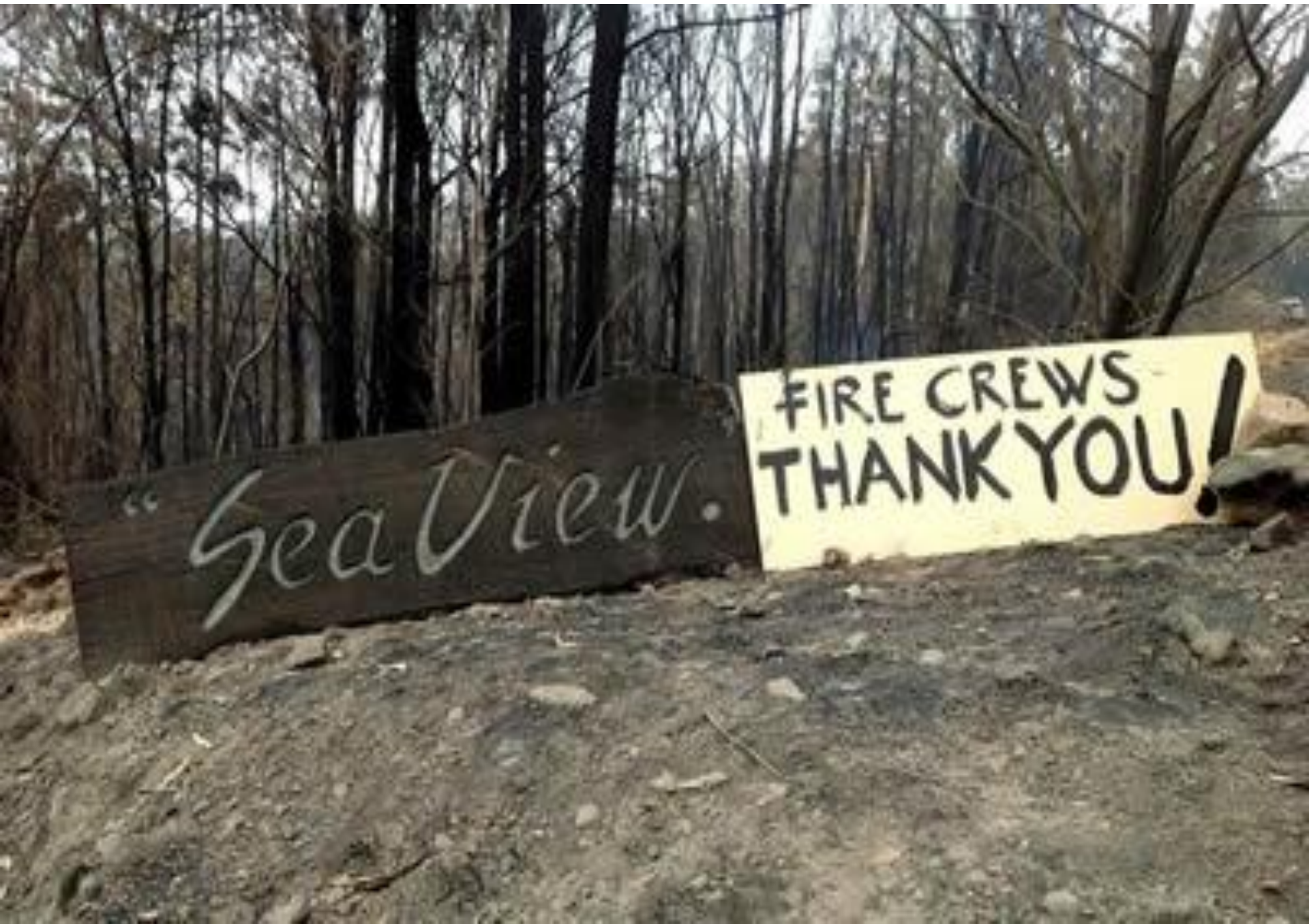
Millingandi fire (Bega Valley LGA)