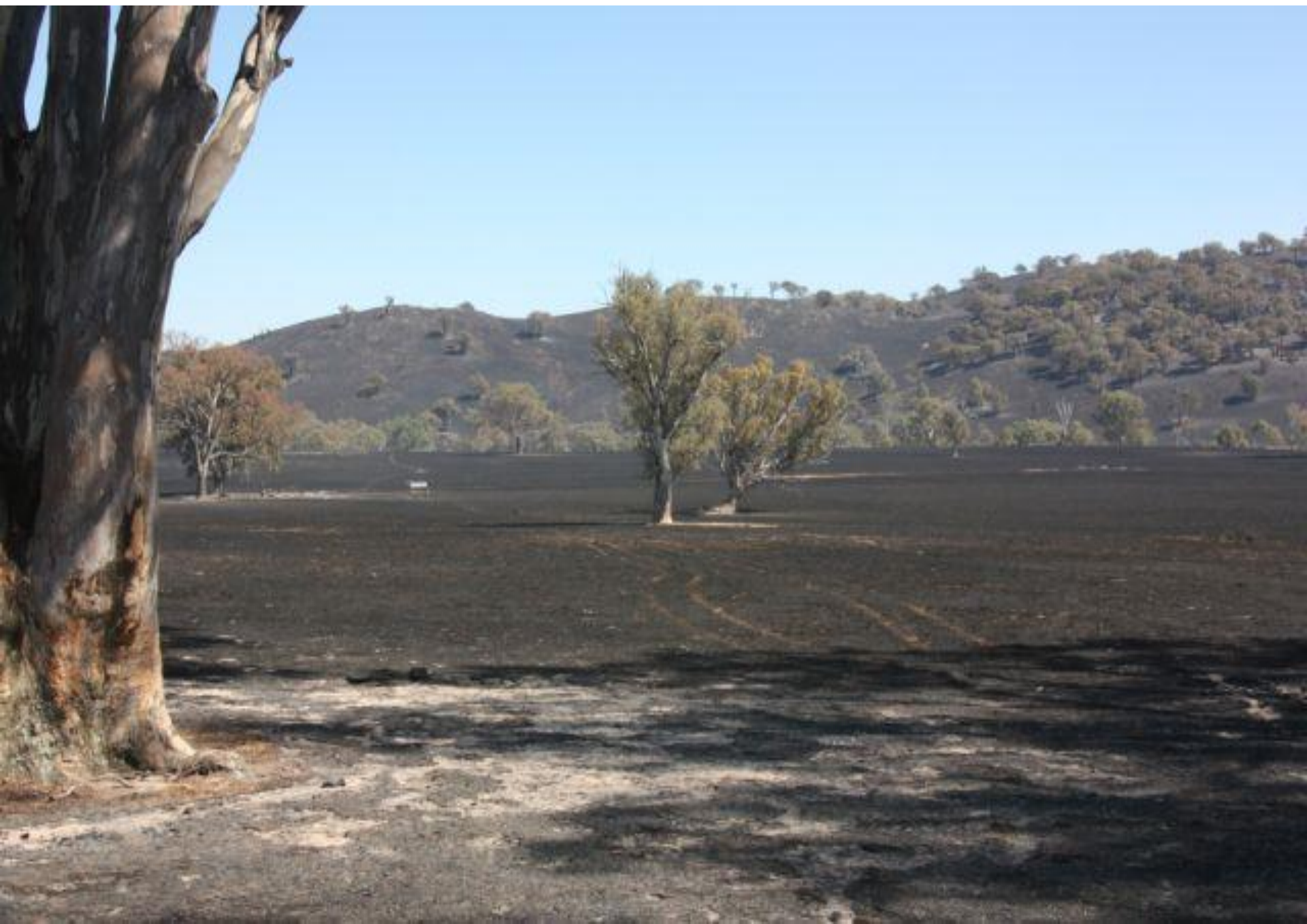
Cobbler Road fire (Harden LGA)