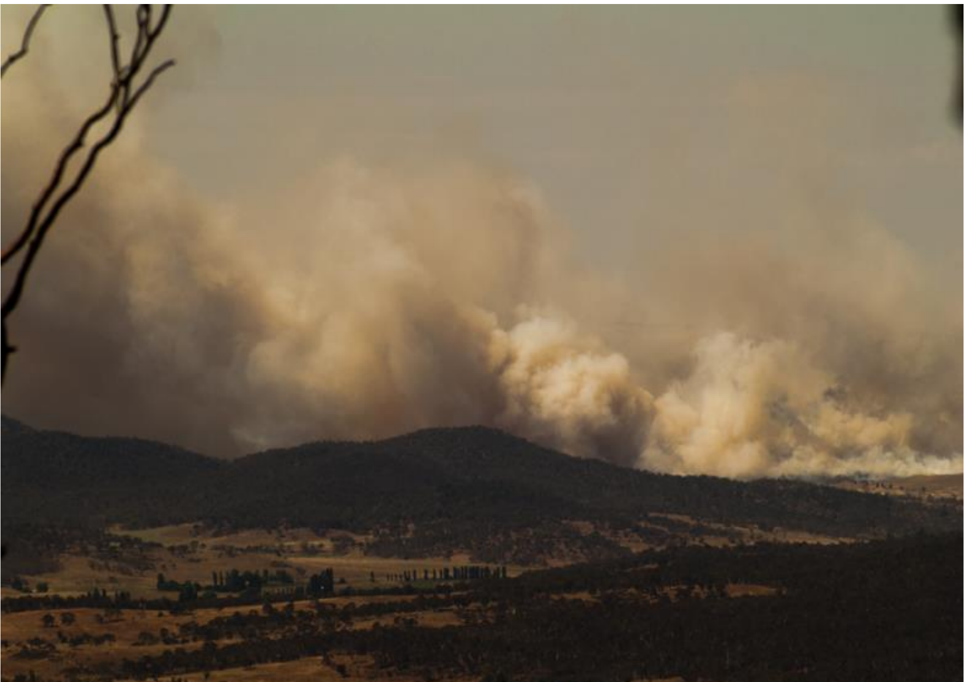
Yarrabin fire (Cooma Monaro LGA)