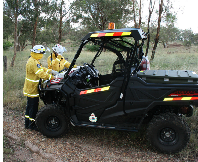
A new all-terrain vehicle (ATV) purchased by the Liverpool Range District as part of the Trust's district funding program.

In late 2021, the Trustees approved and paid $18 million to the NSW RFS to cover the cost of these district projects. The Trustees have set an expectation with the NSW RFS executive that these funds will be spent by the end of 2022.