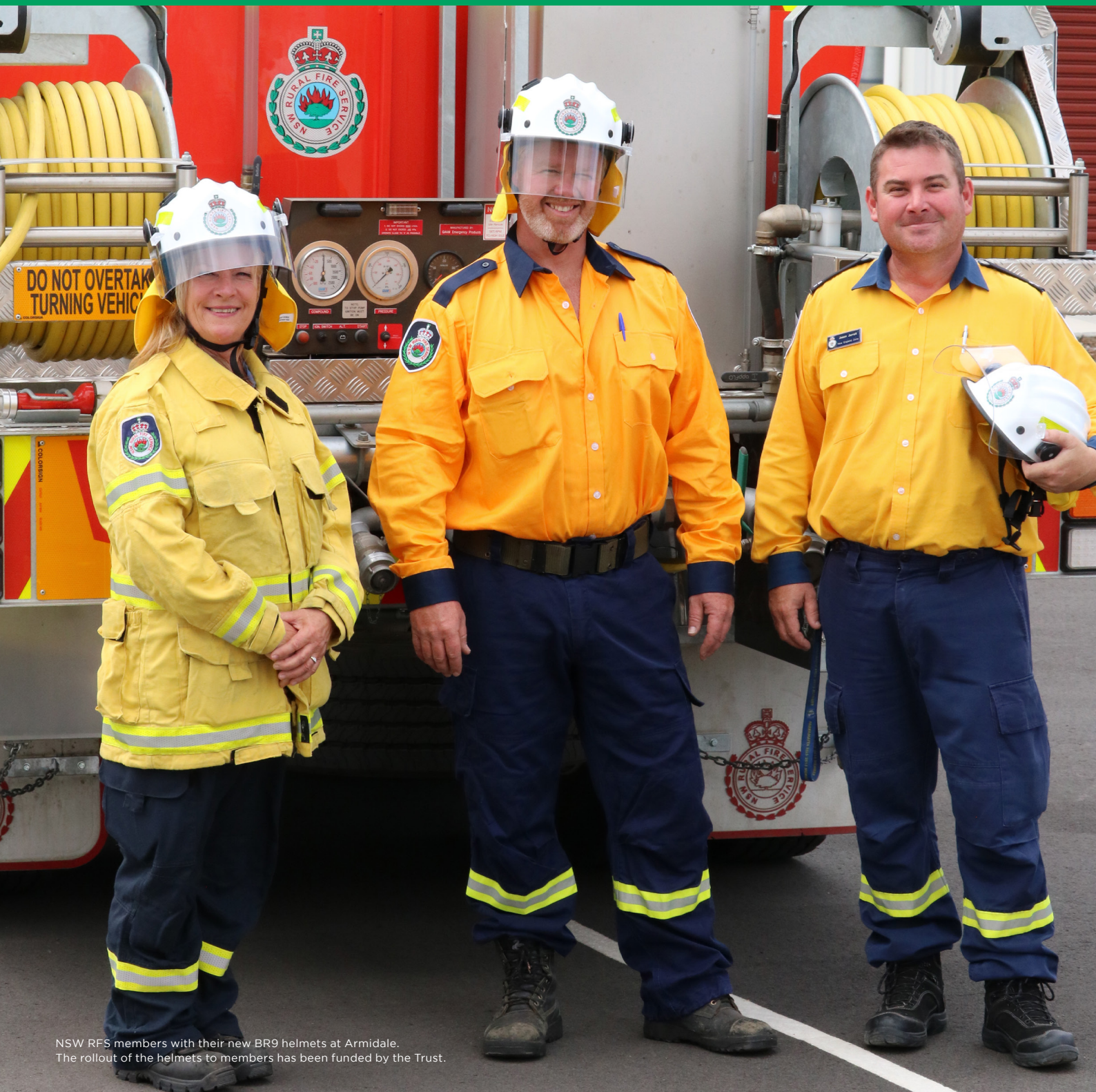
NSW RFS members with their new BR9 helmets at Armidale. The rollout of the helmets to members has been funded by the Trust.