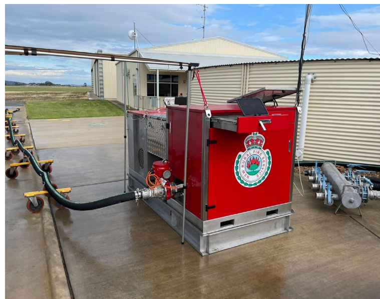
A Retardant and Suppressant Computerised Automated Loading (RASCAL) system at Wagga Wagga Airport for automated pumping of NSW RFS aircraft. One of only two such systems in operation in NSW, purchased as part of the Trust's district funding program.