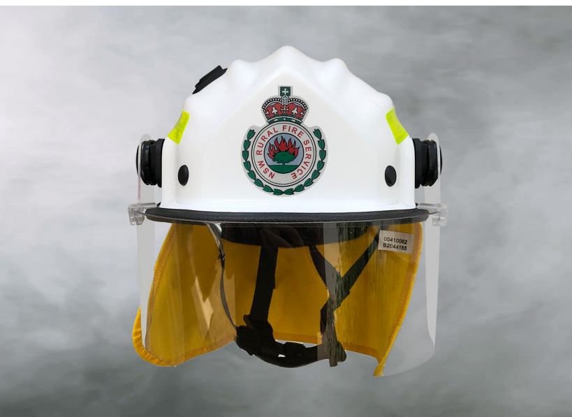
New BR9 helmet

The Trustees have agreed to provide funding of at least $36 million to this project.