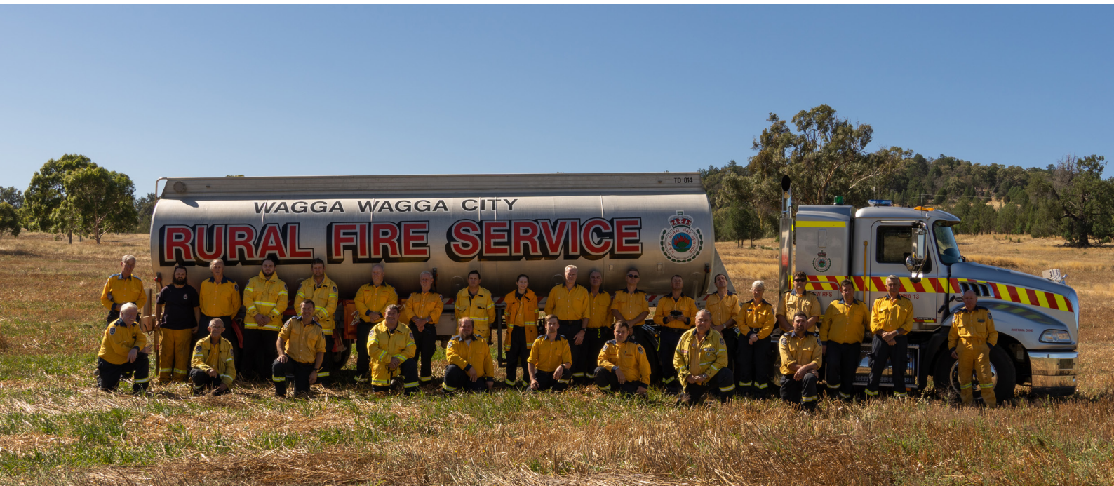
Members of the Riverina District with their new prime mover, funded by the Trust through the Brigade Grant Scheme.