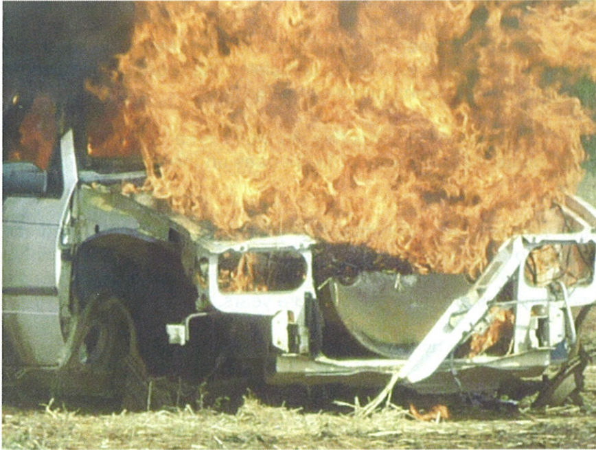
Tullibigeal Exercise Car fire