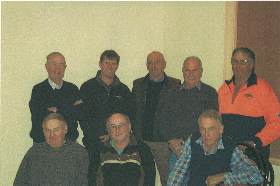
Members of Melrose Plains RFB receive Long Service Awards