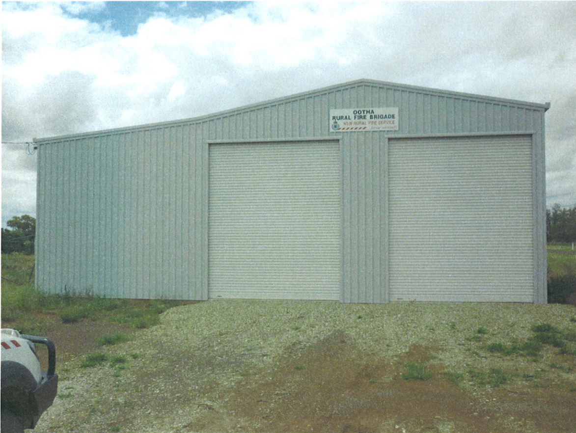
Ootha Station in the final stage of construction