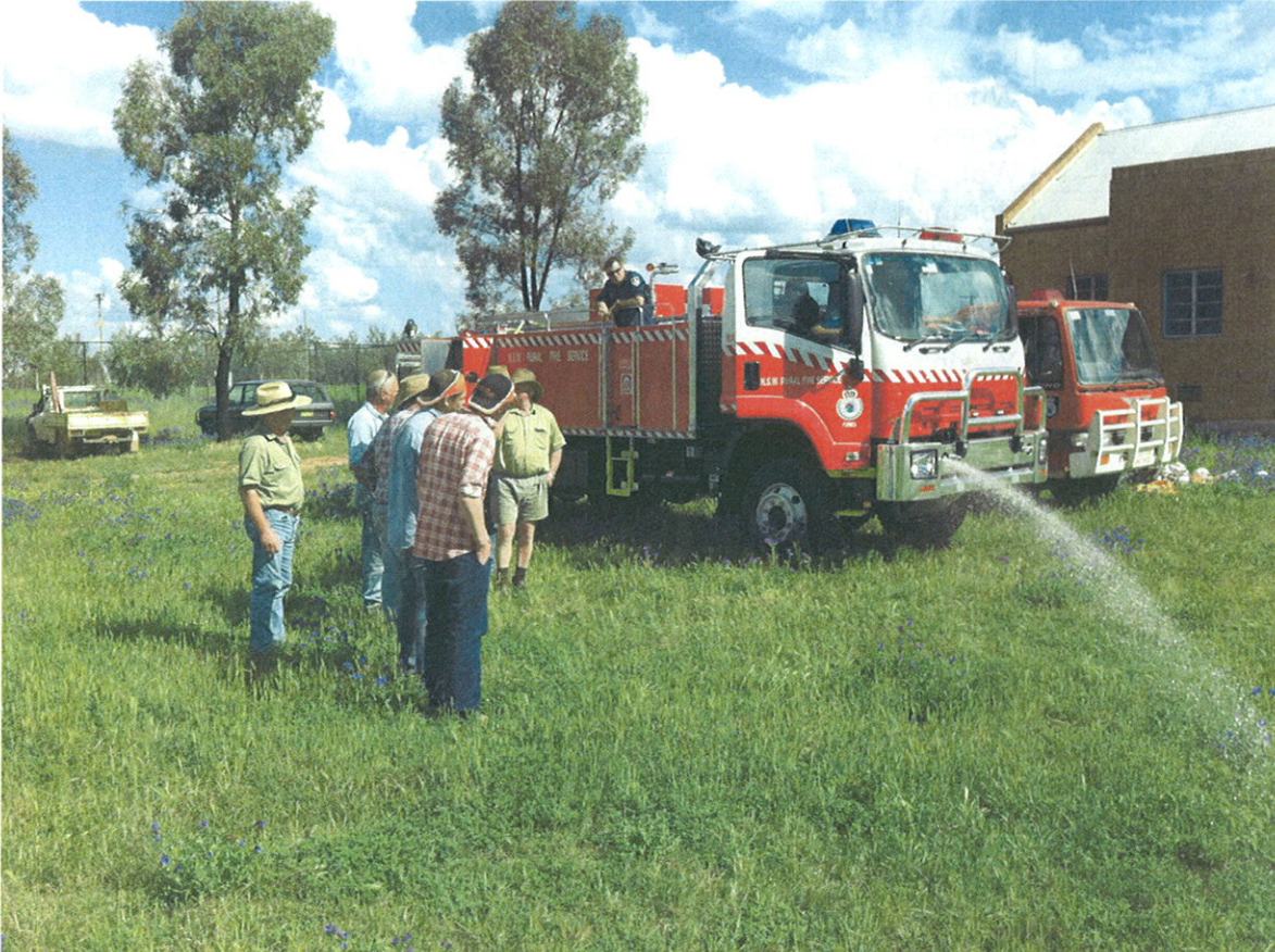
Warroo members inspecting their new Cat 1 Tanker