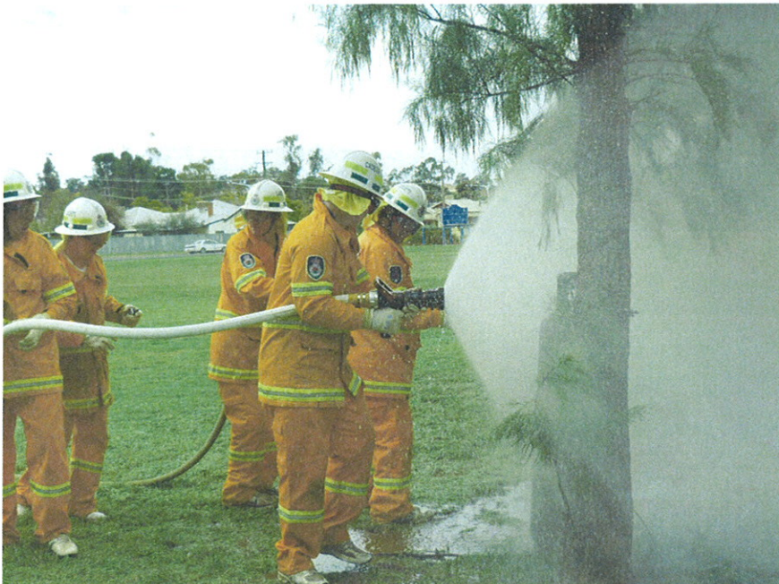
Condobolin High School Cadets