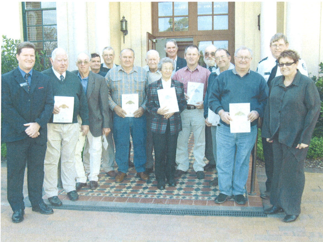
Long serving members of Forbes Brigades received awards from FSC