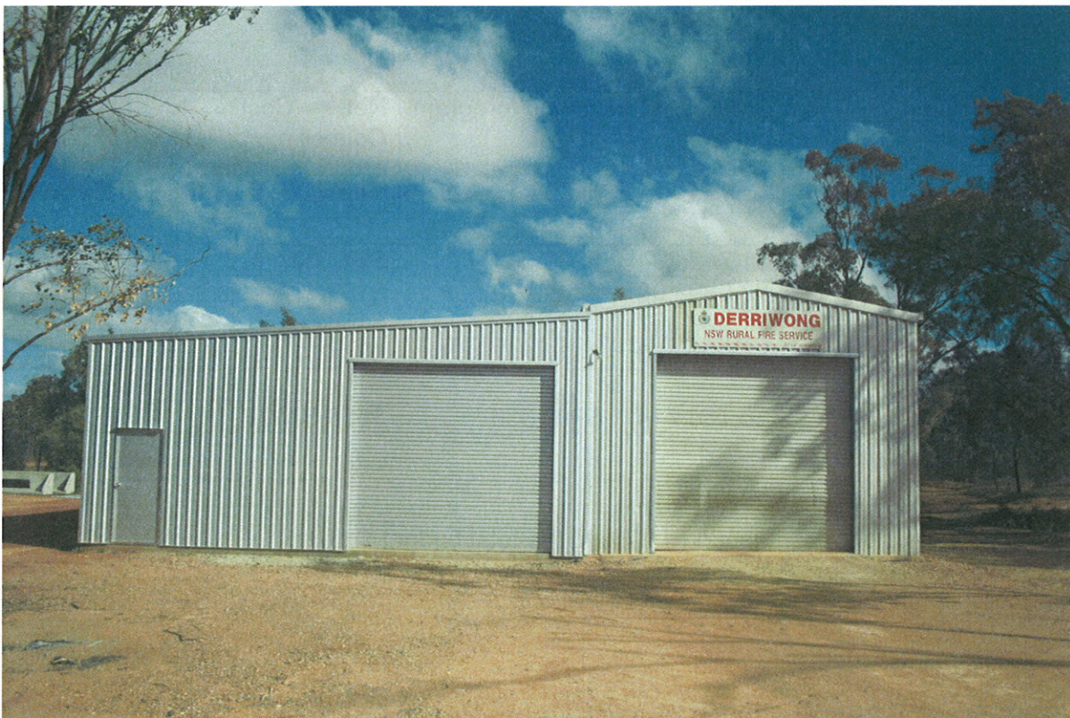
Completed extensions at Derriwong

During 2009/10 new Fire Stations were completed to house tankers for the Ootha, Garema, Gunning Gap, Vychan and Weelong Rural Fire Brigades in the Forbes Council area and also for the Eualdrie and Piney Range RFB's in the Weddin Shire. Extensions were completed at Derriwong and Albert Stations with work to commence shortly on the new Fifield Station in the Lachlan Shire. Extensions to the Alectown Station and a new storage shed at Parkes HQ Station were completed and construction should also begin on new Stations for Bogan Gate and Trundle in the Parkes Shire in early 2011.