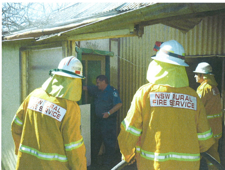
Weddin Exercise Smoke House