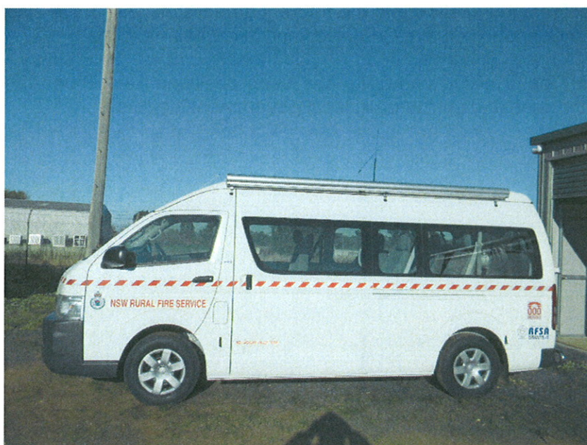
A second hand bus purchased for the MLVT from a grant received from the Rural Fire Service Association

During the period the NPWS have undertaken several hazard reduction burns in areas of high risk identified through Bush Fire Risk Management Plan. These burns have been supported by volunteers within the MLVT.