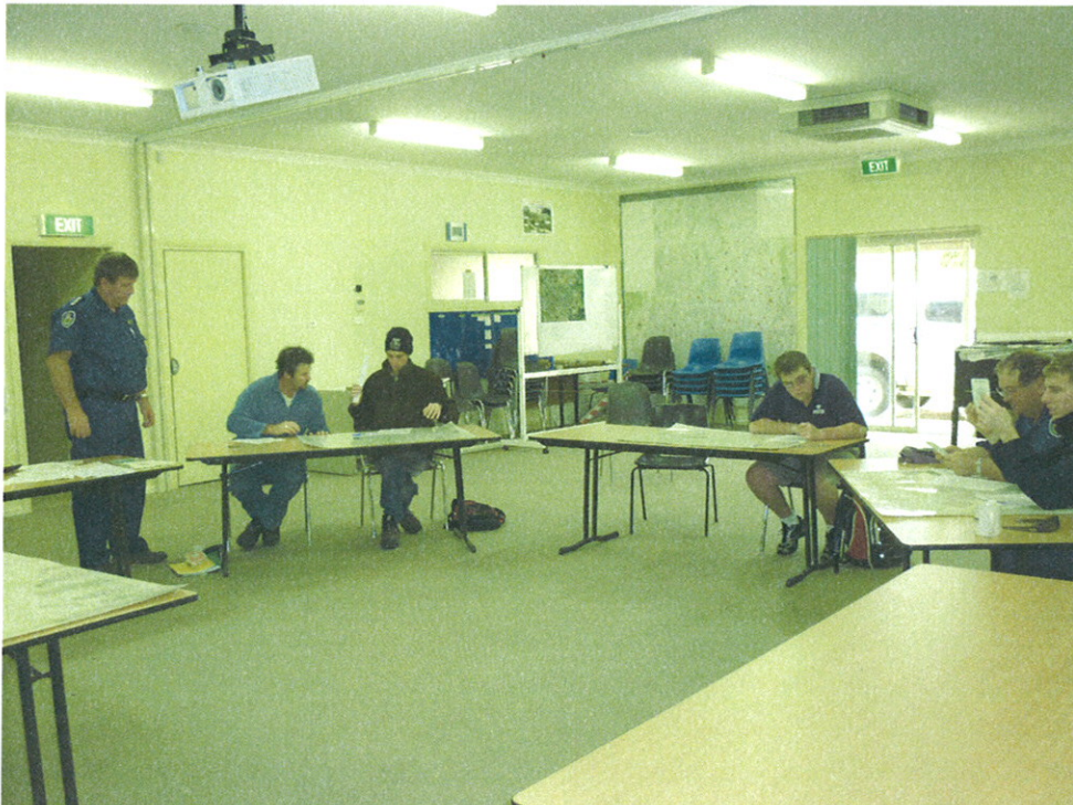
Advanced Firefighter Training

Some of the planned courses for the year were cancelled because of wet weather and some were cancelled because of lack of nominations. We have learnt to be flexible and move some of the scheduled courses for the participants and trainers.