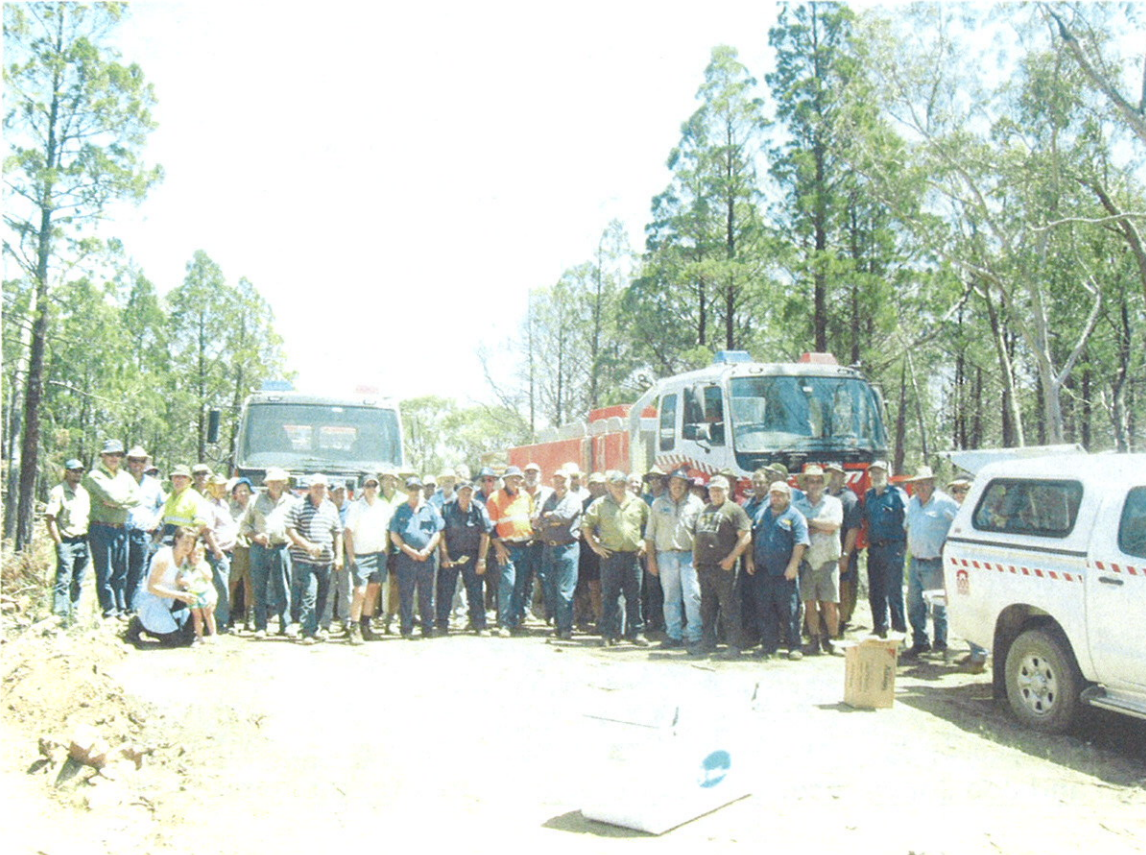
Volunteer members from Weddin inspect fire trails on Weddin Mountain