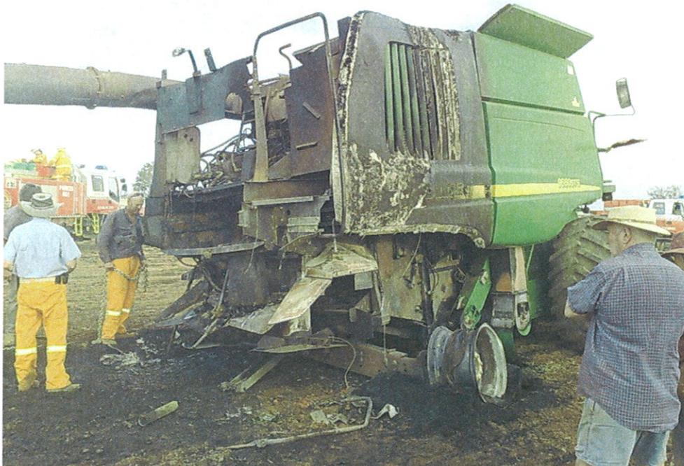
Volunteer members extinguish a header fire in Parkes

All Brigade frontline tankers are diesel powered and the new design tankers offer the latest in crew protection equipment.