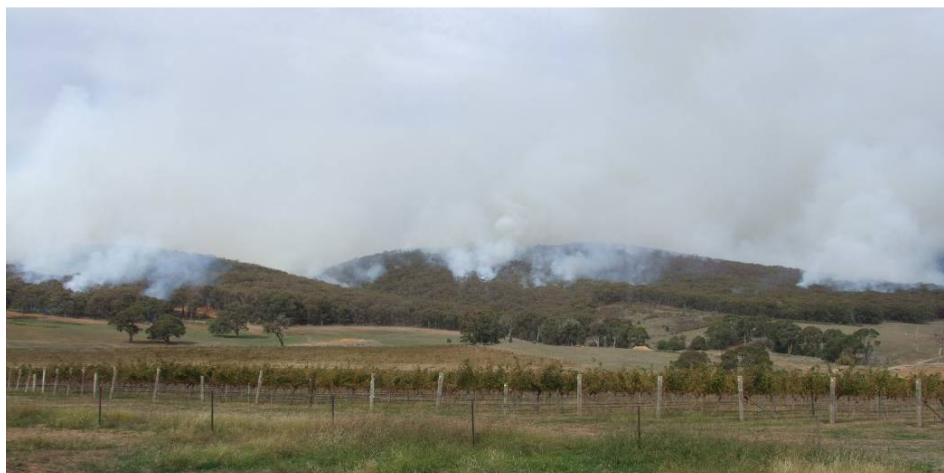
Greening Lane HR Burn Autumn 2006 Orange

Additionally in excess of 2270 Ha of works was carried out by Councils within the Canobolas Zone providing Community protection. This is a total of 7,164 hectares compared to our benchmark target of 9,461. Out target was short due to the rain received in May and June 2007.