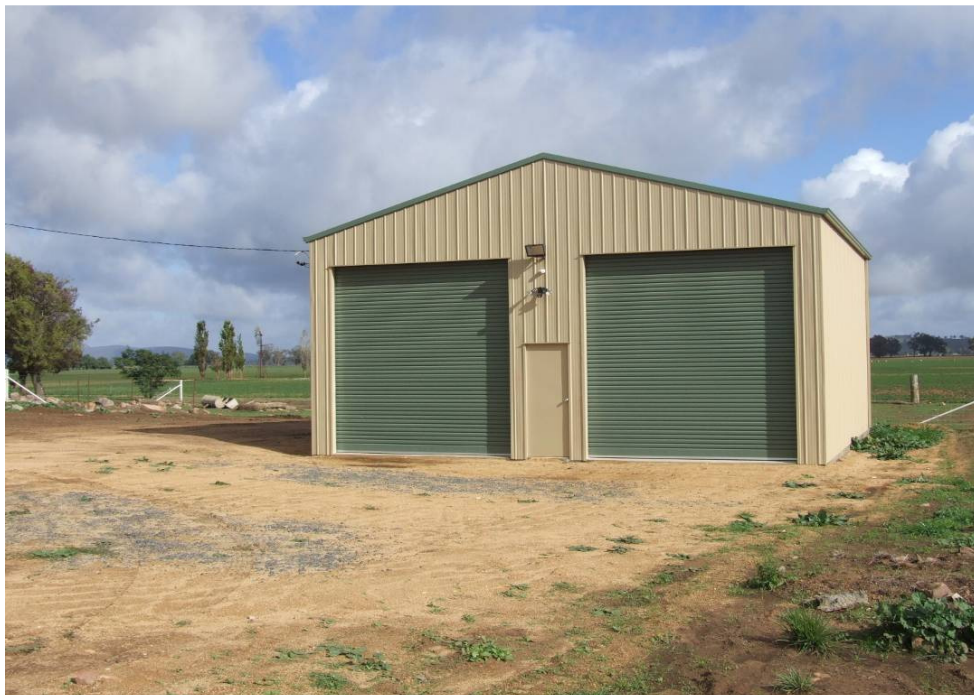
The Rivers Brigade Station (Cowra)