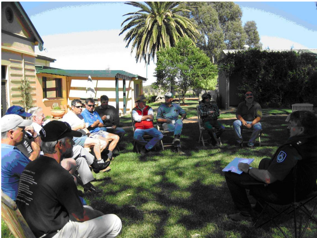
Gum Tree Meeting at Canowindra May 2007

The progress made from this strategy of actively communicating with our volunteers on a regular basis is working to build a strong rapport between our staff and volunteers. The continual message at each meeting from the volunteers is to keep these meeting going as they productive, enjoyable and a great thing.