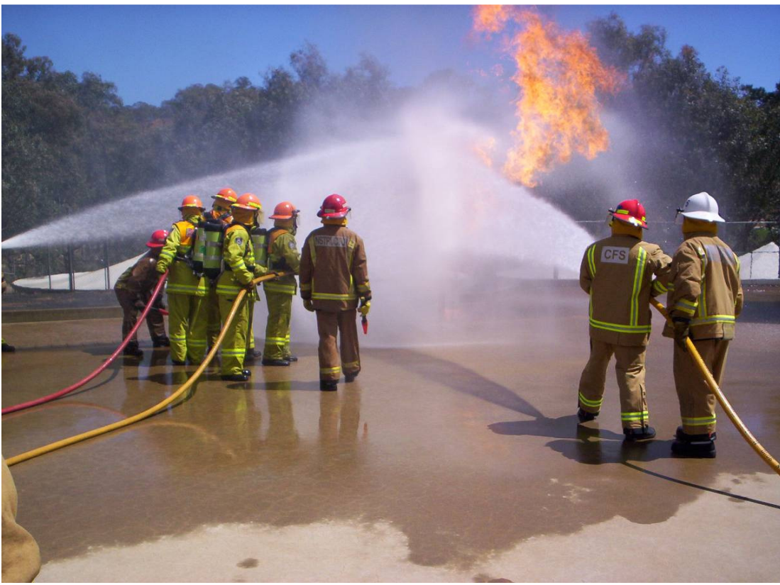
RFS & CFS Fire Crews on the LPG Pad at Brukunga SA

The Zone Learning & Development Officer has been involved over the past 12 months in providing pilot training for CABA Crews based at the CFS Brukunga Training Facility in South Australia. The experience gained from this involvement will be invaluable in setting up similar facilities for the NSWRFs.