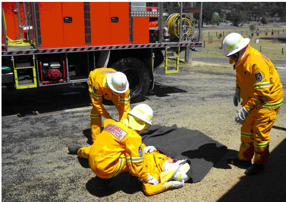
BF Training & Assessment Molong 2006