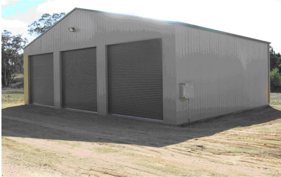
Walli / Island Brigade Station (Cowra)

During 2006/07 new Fire Stations were completed to house tankers for the Walli - Islands Brigade and the Rivers Brigade in the Cowra Council area and also for the Newbridge Brigade in the Blayney Shire.