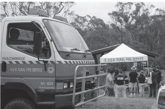
Community education programs