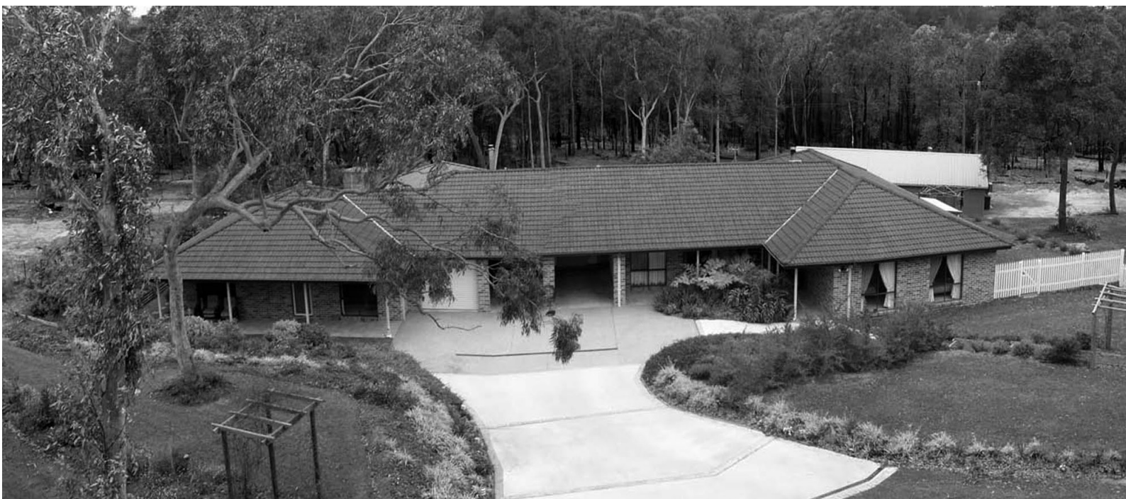
Maintaining the property and landscaping is of critical importance

In considering all DAs, the type, location and ongoing maintenance of landscaping, within the APZ is a necessary bush fire protection measure. Appendix 5 provides advice.