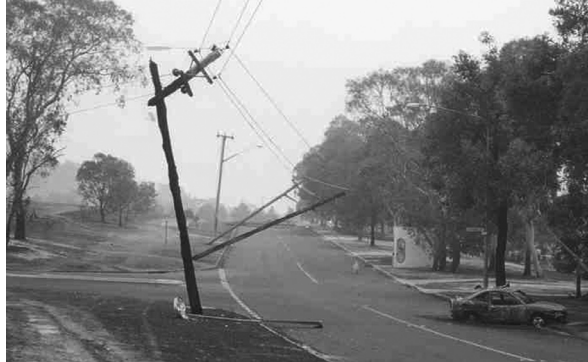
Services can be cut during a bush fire

Adequate supply of water is essential for fire fighting purposes when considering all forms of development. In addition, gas and electricity should be located so as not to contribute to the risk of fire or impede the fire fighting effort.