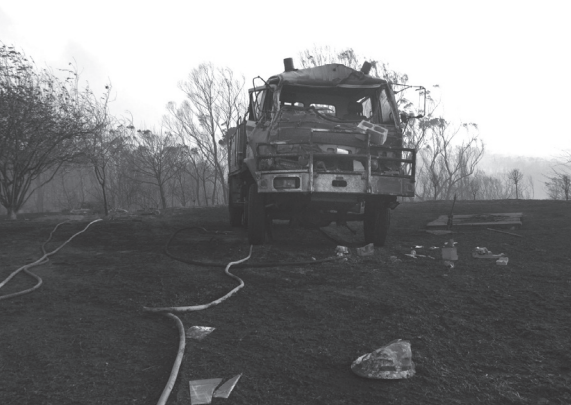
Access for firefighting should be safe.