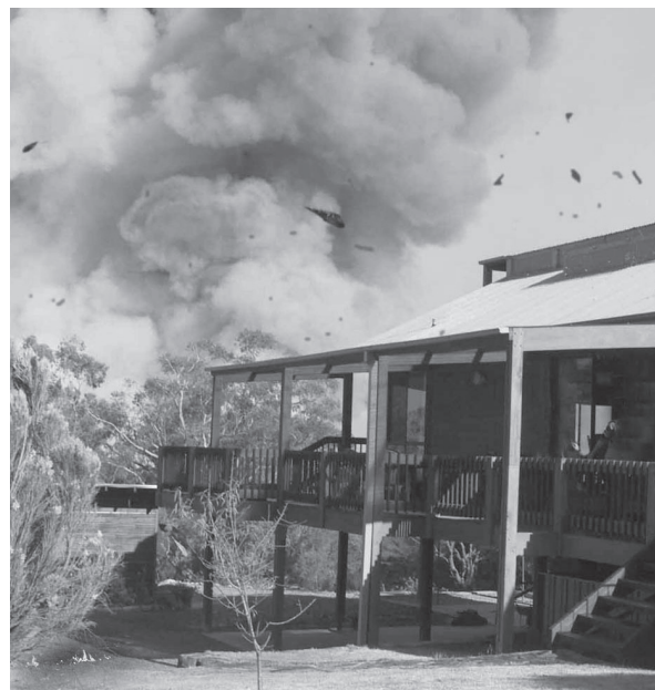
Reduce the vulnerability of buildings to ignition from radiation and ember attack