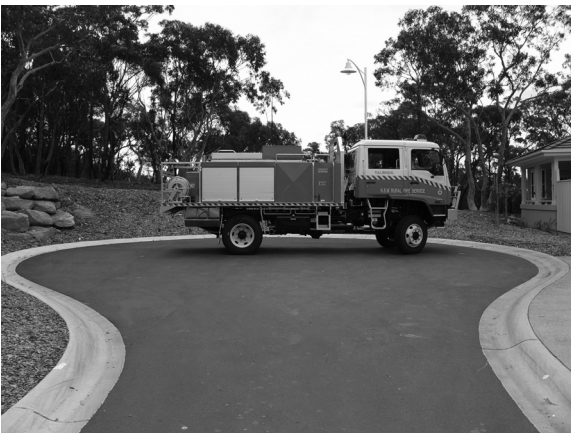
Fire fighting vehicles need access to the urban bushland interface.

For new subdivisions and large scale SFPPs, design of public and property access roads should enable safe access, egress and defensible space for emergency services. Fire trails enable access for management of APZs. These principles also apply for other developments but greater emphasis on landscaping, construction and other BPMs may be necessary.