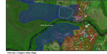
Insetmap 2: Wangaroo Valley village