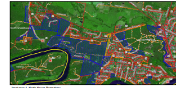
Insetmap 1: North Shoals boundary