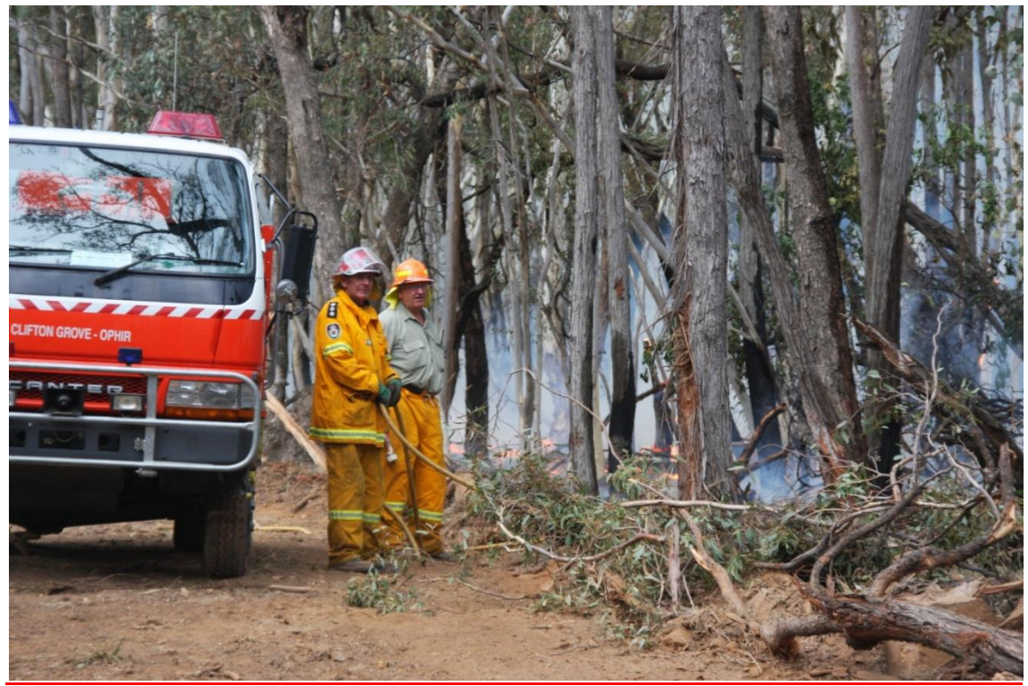
Clifton Grove-Ophir crew conducting the Yellocks HR in eastern Cabonne