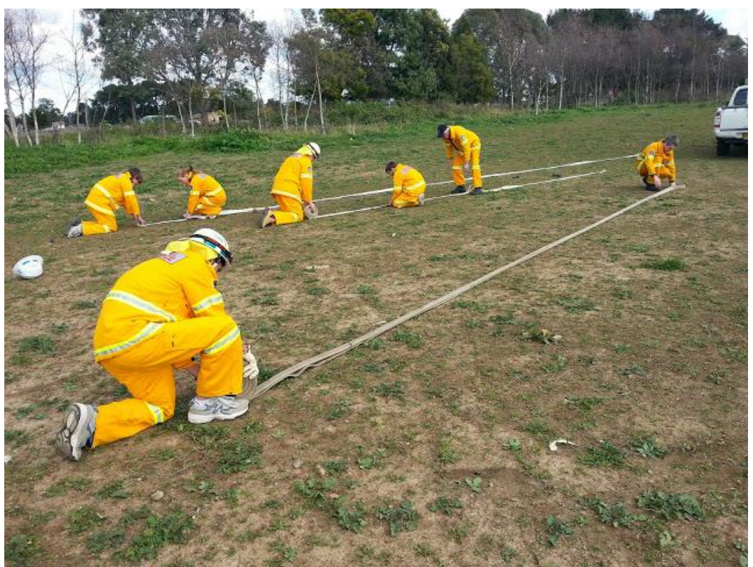
Cadets learning hose rolling and bowling