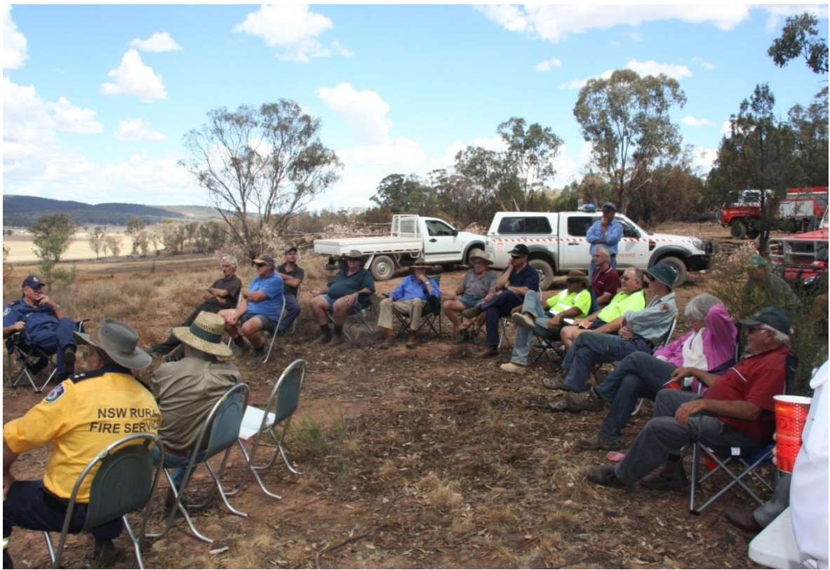
AAR for the Nangar Road Fire February 2013