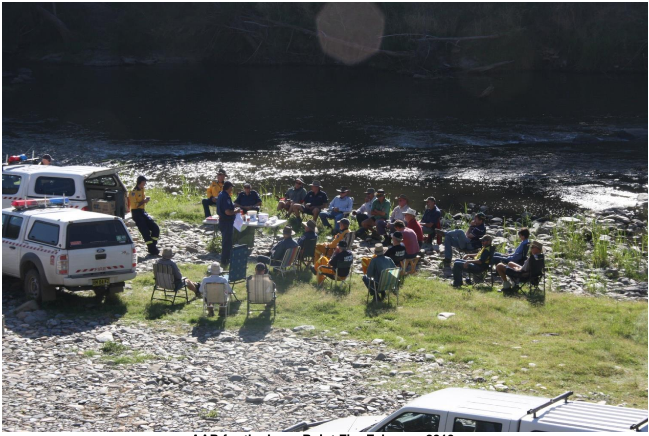
AAR for the Long Point Fire February 2013

During the 2012/2013 period the total volunteer membership increased by 4 personnel across the four local government areas. We had 112 new members and retired or resigned 108 members across the Canobolas Zone. During the past 12 months this small increase is encouraging at a time where the anecdotal evidence suggests a population decline and age increases across rural communities. Whilst the average age of our membership is increasing it is clear that the greatest challenge over the next decade will be the renewing our workforce whilst maintaining the local knowledge and fire behaviour and suppression capability that is interwoven into the skill set of our more senior members.