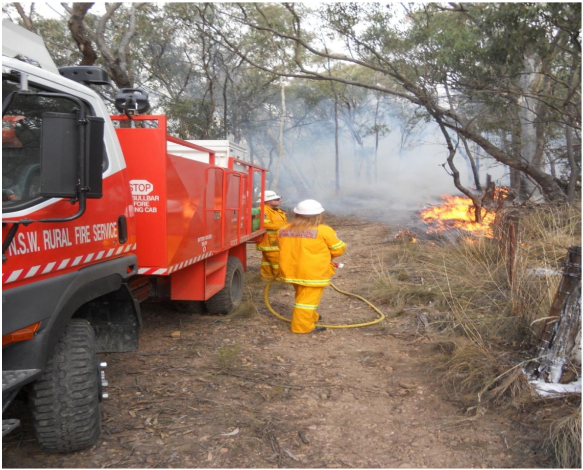
HR Clifton Grove