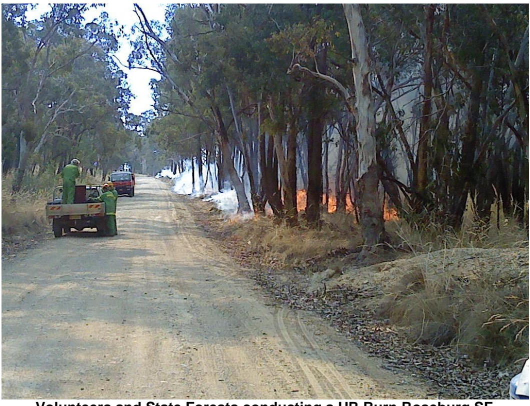
Volunteers and State Forests conducting a HR Burn Roseburg SF