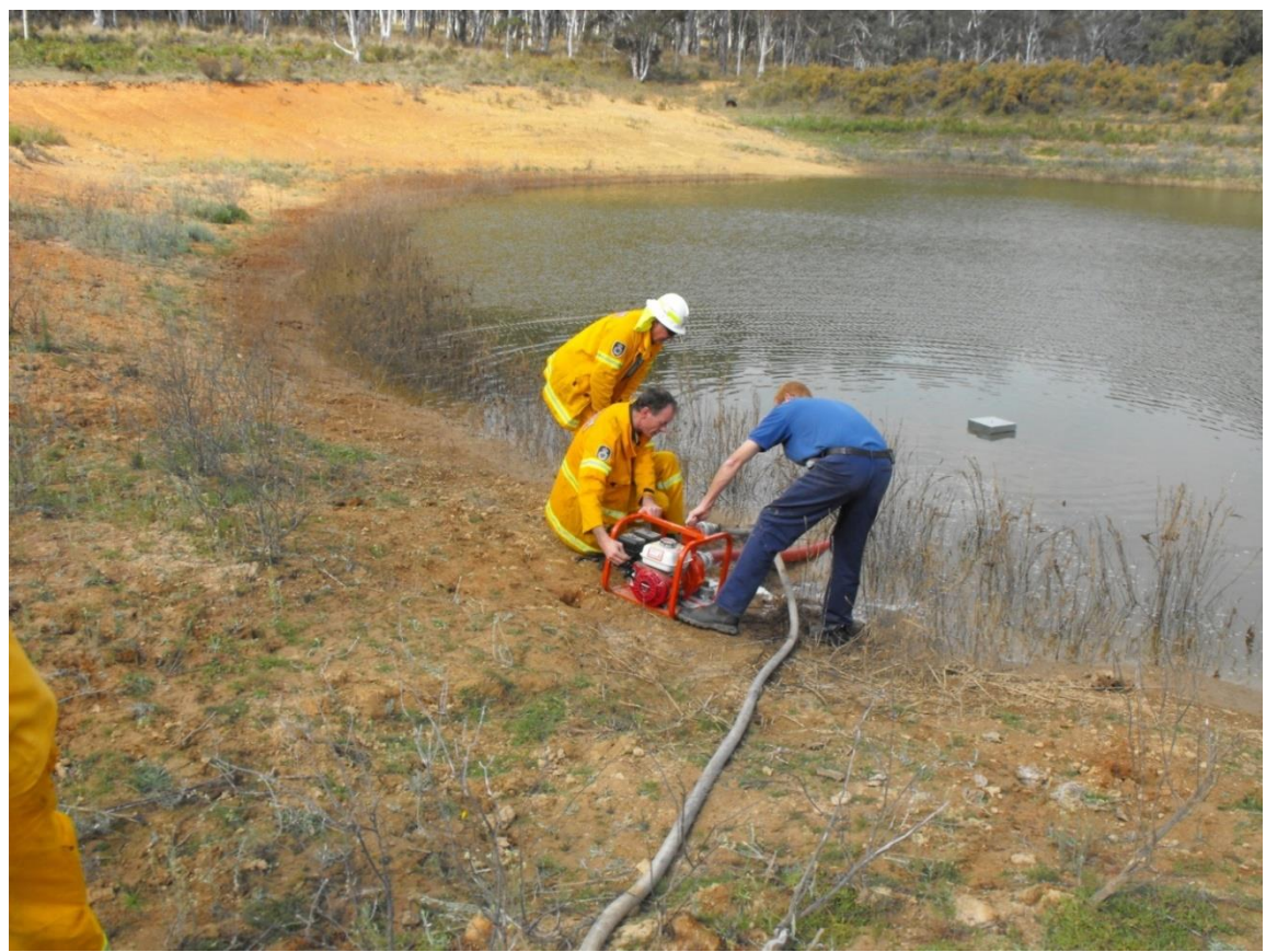
RFS members undertaking pumping training April 2013