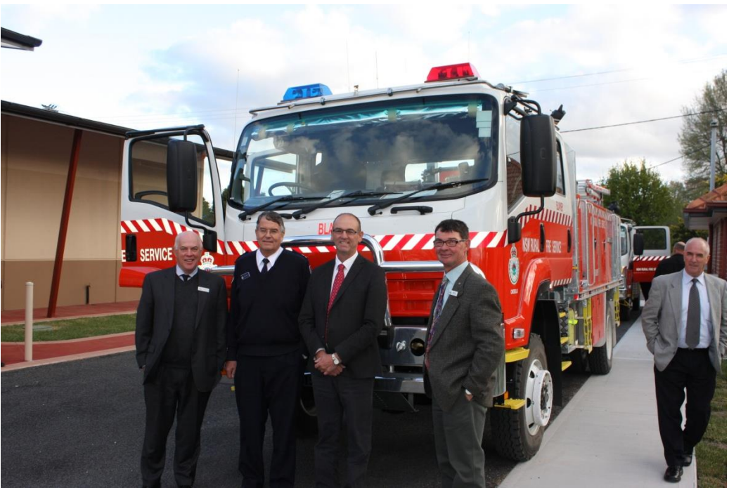
New Blayney Cat 1 Tanker