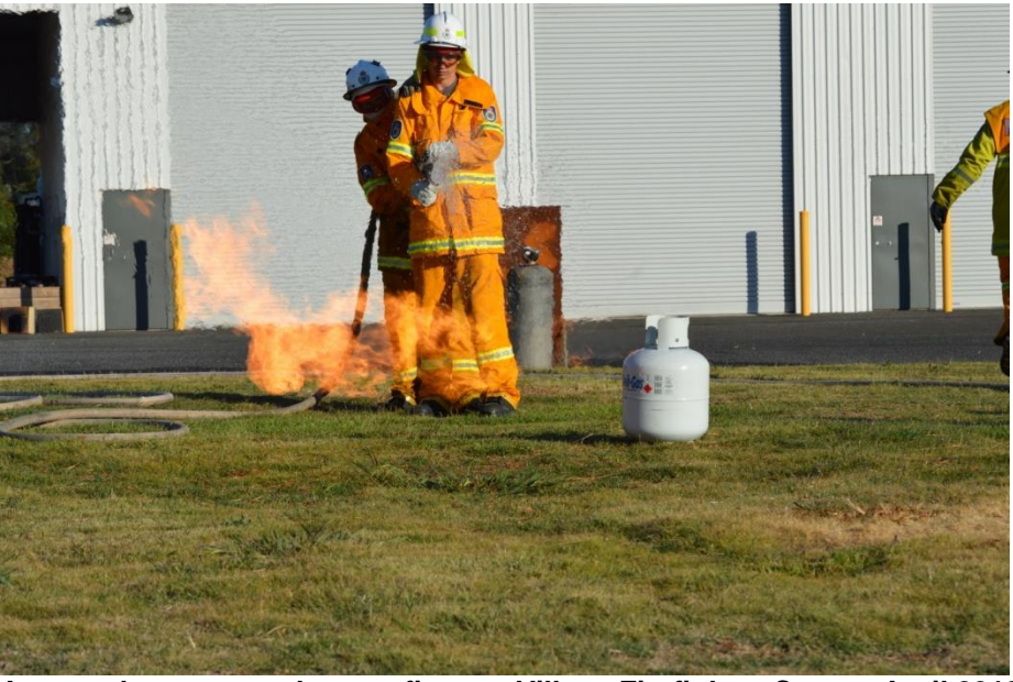
A crew about to attack a gas fire at a Village Firefighter Course April 2013

The SAP data base system had some teething issues and these have been worked on throughout the year. There has been a number of improvements that has assisted staff to complete work in a reasonable time frame. This year also found the RFS upgrading the MyRFS web site and Online learning system with the Safety and Volunteer Inductions being completed by new members over the internet directly inputting the qualification. Region West Online learning option through the Moodle network has expanded the number of courses to include First Aid Application, Group Leader and Rural Fire Driver. This system only covers the theory component that can be adapted to Online learning.