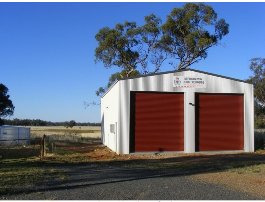
Merriganowry Brigade Station