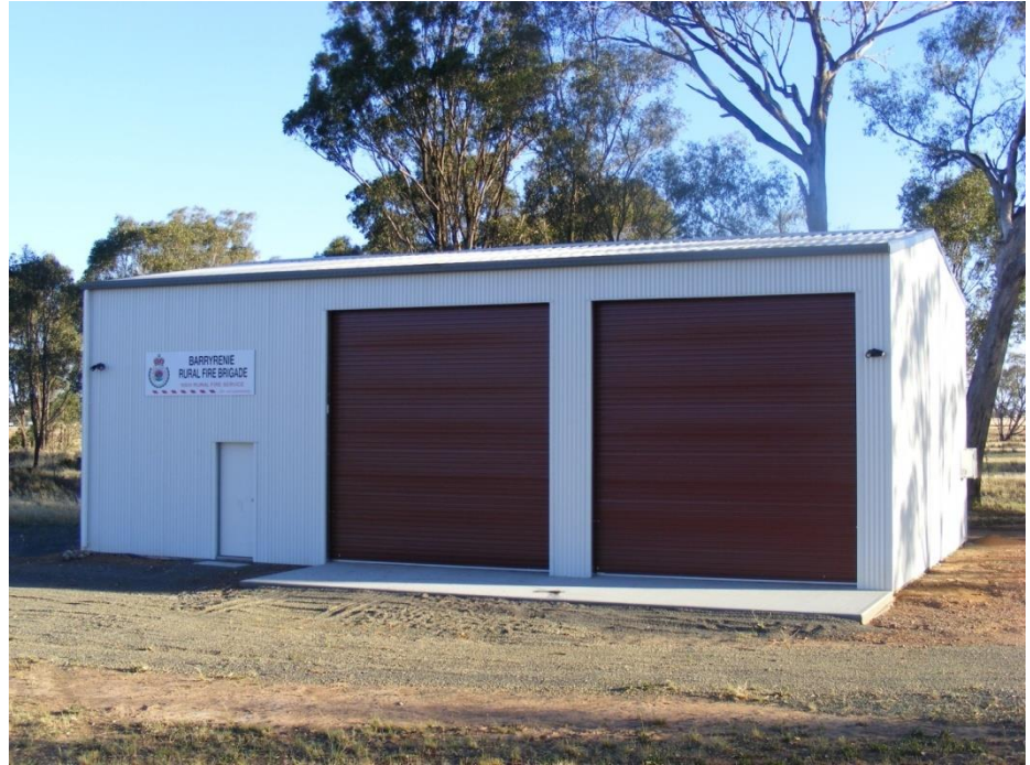
Barryrenie Brigade Station

Stage 2 of these projects will be funded in the 2013/2014 year with the completion of the interior fit out of these extensions and Stations.