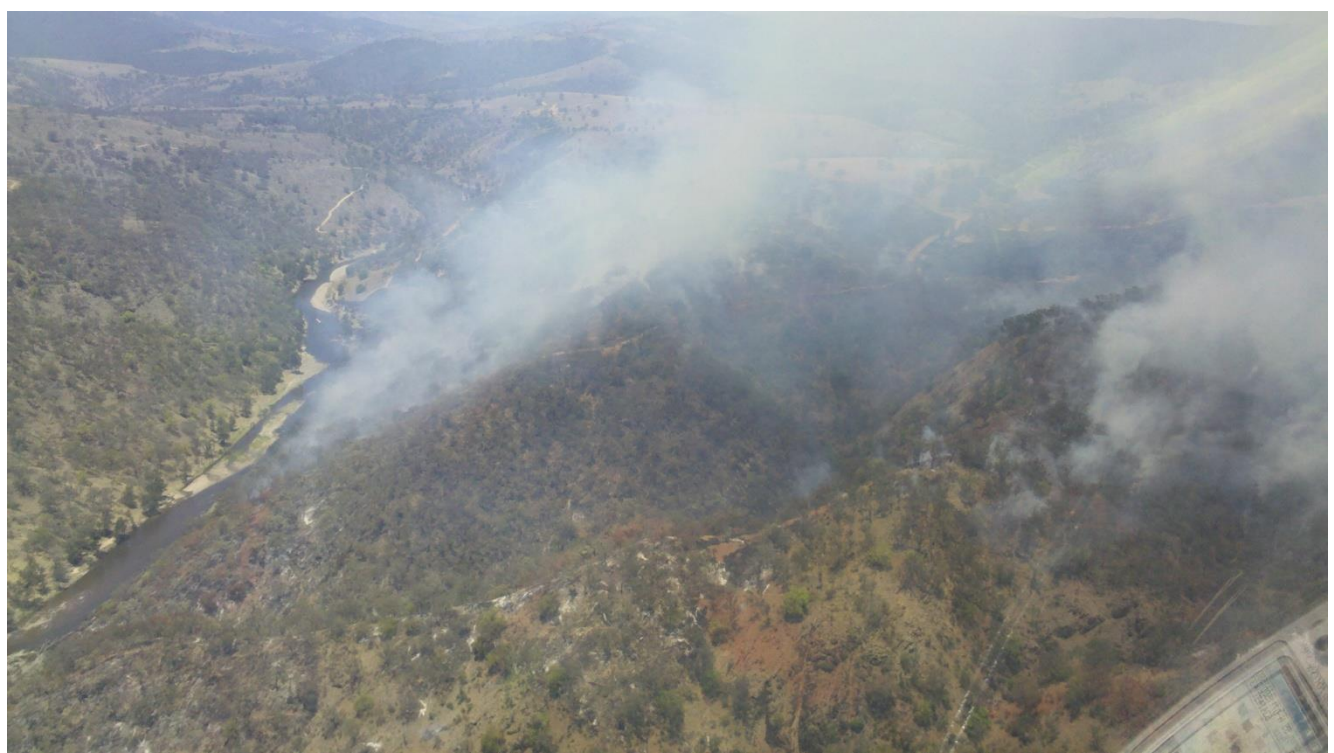
Long Point Fire January 2013 – looking south

Losses incurred during the BFDP included 40 Sheep and 20 Cattle along with 20kms of fencing, the majority of these were at the Shiel Fire, Woodstock.