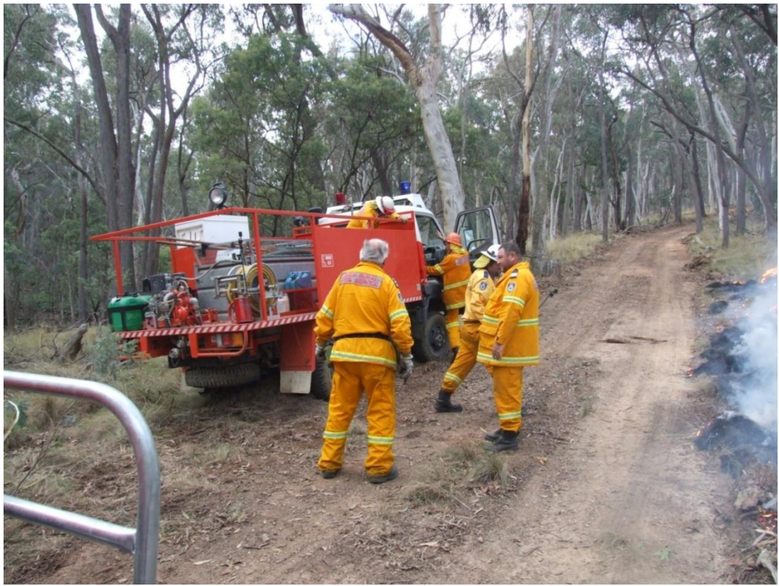
Volunteers conducting a HR Burn in the Neville area

The Canobolas Zone ratio for 2012/2013 was 6.812 hectares of hazard reduction for each hectare lost by wildfire. The Zone benchmark target is set at 7:1.