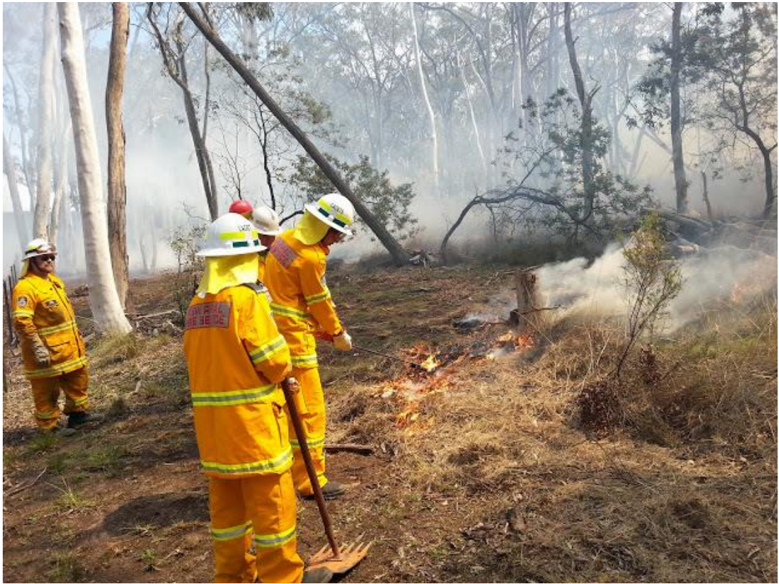
Learning about fire behaviour and HR activities