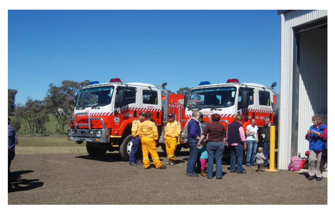
New Isuzu Cat 1 Tankers delivered