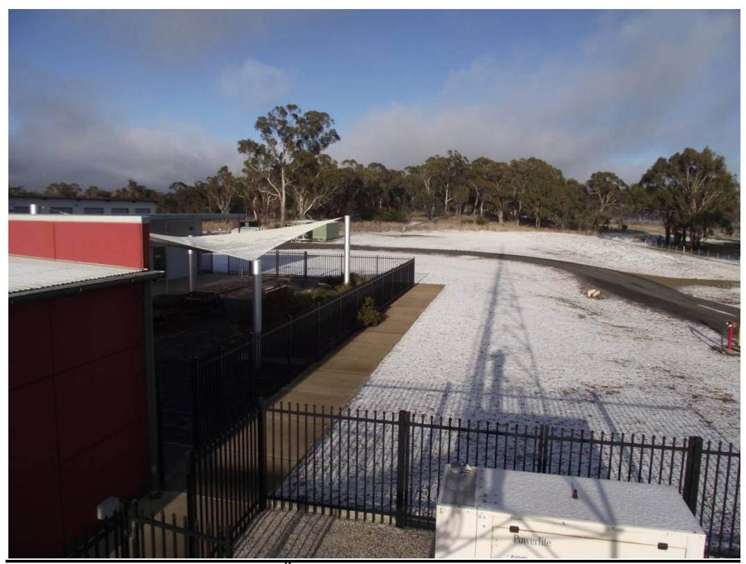
Morning of 10<sup>th</sup> August 2012 snow covered FCC