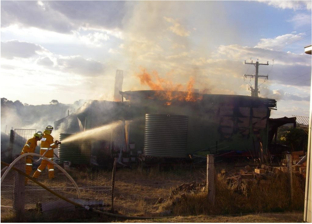
House fire Newbridge January 2013