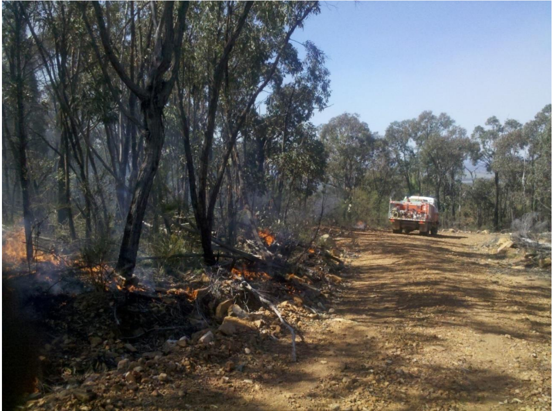
Assisting National Parks & Wildfire Service within the Goobang NP