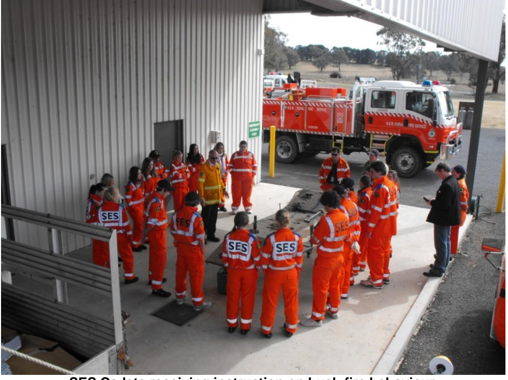
SES Cadets receiving instruction on bush fire behaviour

Training is still being taken out to the brigades as requested or held close to where the majority of the participants, on a particular course, reside.