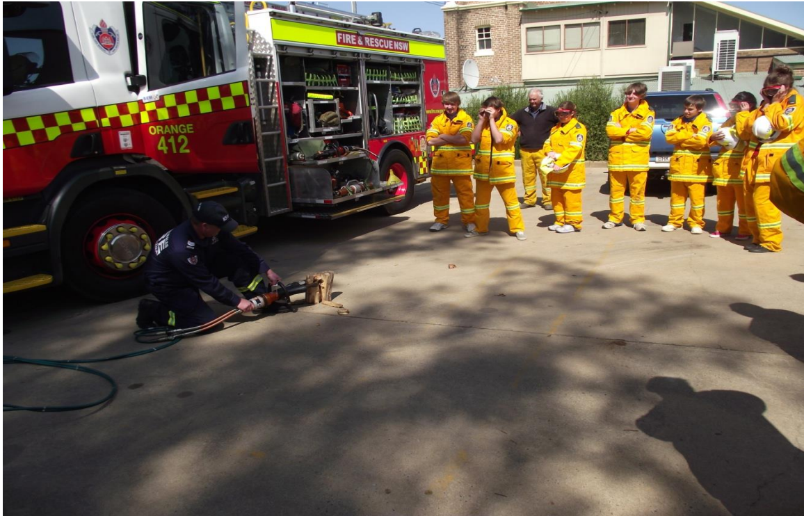
Cadets learning about rescue activities