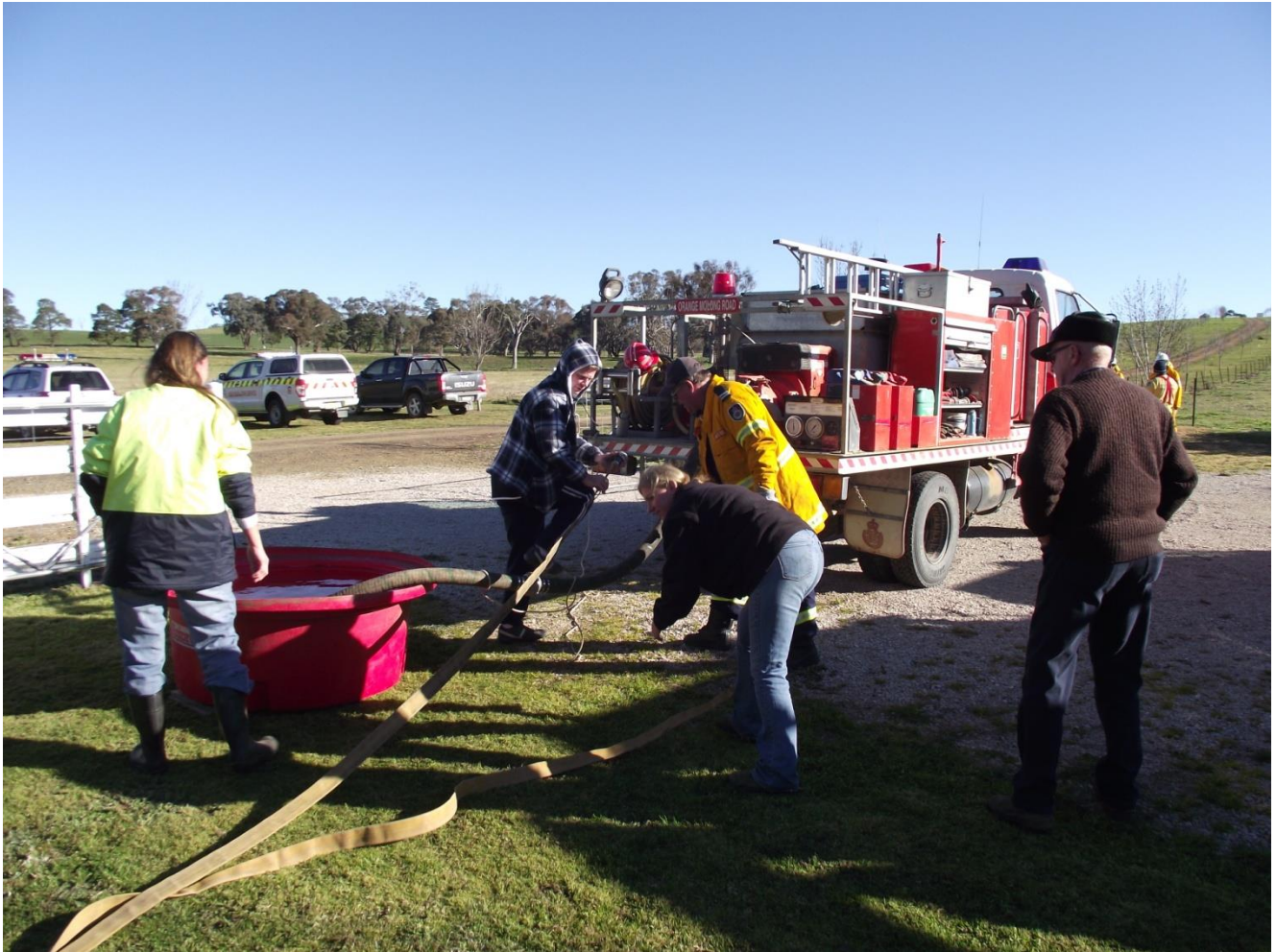
BF Training Orange Molong Road