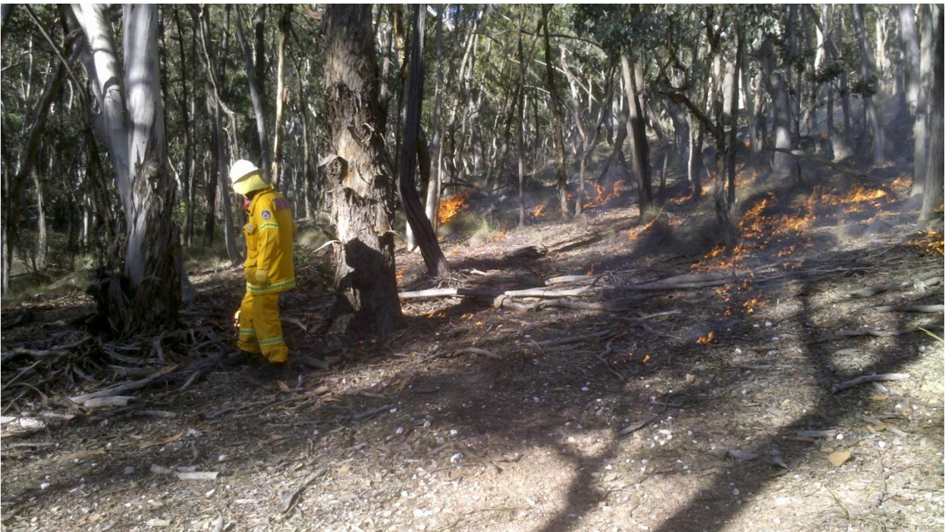
Volunteers conducting a HR Burn in the Mandagery/Manildra area

“Where Risk Management is our Passion and Hazard Reduction is our Priority”