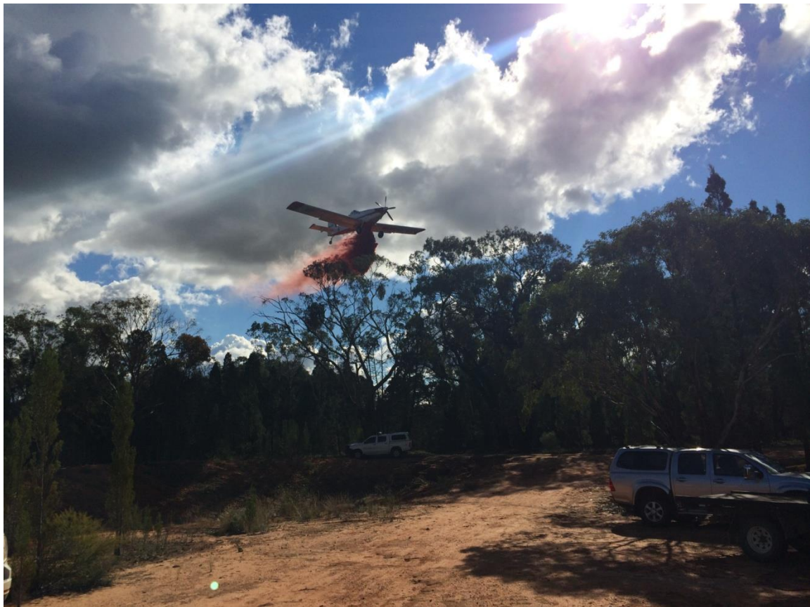
Volunteers and senior field officers examine aircraft bombing effectiveness

“Where Risk Management is our Passion and Hazard Reduction is our Priority”