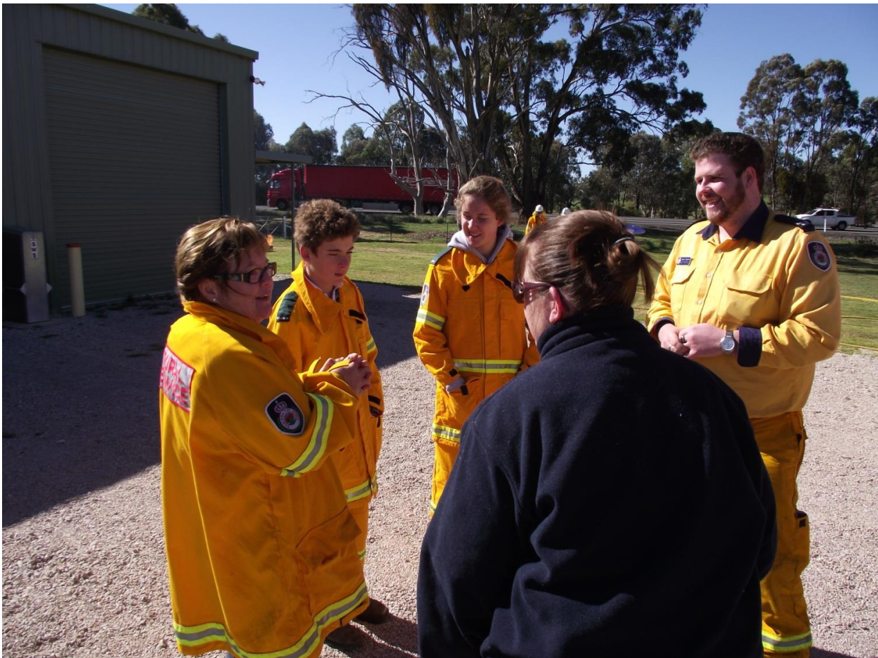
Two new member types badly needed in the RFS - 1 - Young and 2 - Female!

This year Head Office provided every brigade with a “Volunteer Recruitment and Retention Kit”. These kits are to assist brigades with their long term viability through tried and tested ways, new initiatives and ideas that may work in their particular community and area of operation.