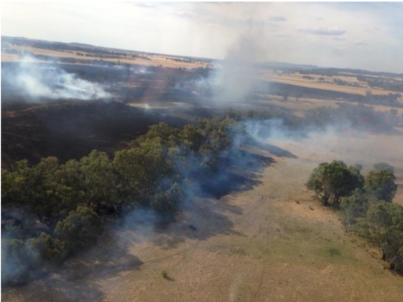
Cannon Road Fire late afternoon Day 1