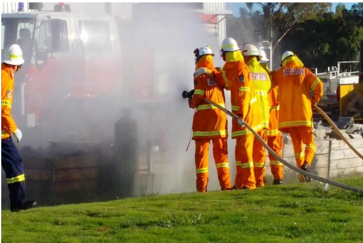
Village Firefighter Course April 2014

This year the RFS upgrading the MyRFS web site and the Online learning component within it, so that the Safety and Volunteer Inductions being completed by new members over the internet directly inputting the qualification against the member's record.