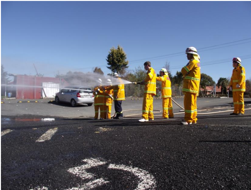
Cadets receiving instruction on nozzles and hose

The programme is overseen by Canobolas Zone staff and the training is provided by several volunteer members.