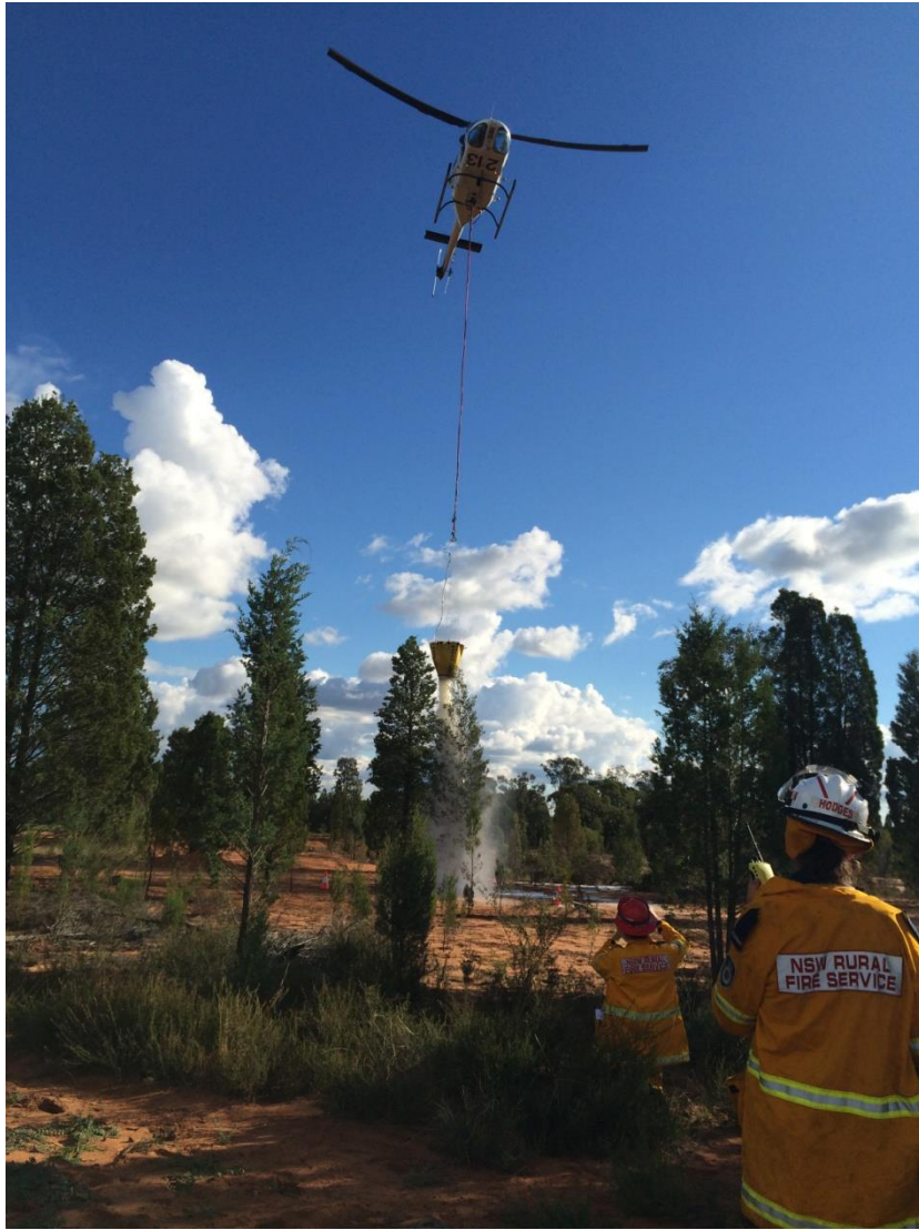
Crew Leaders learning to direct pilots with bucketing

“Where Risk Management is our Passion and Hazard Reduction is our Priority”