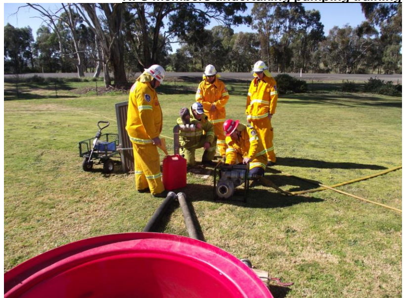
RFS members undertaking pumping training

“Where Risk Management is our Passion and Hazard Reduction is our Priority”