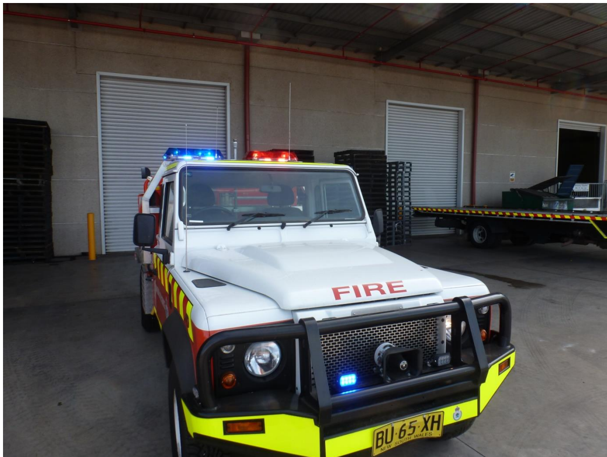
New Byng – Emu swamp Cat 9 Tanker