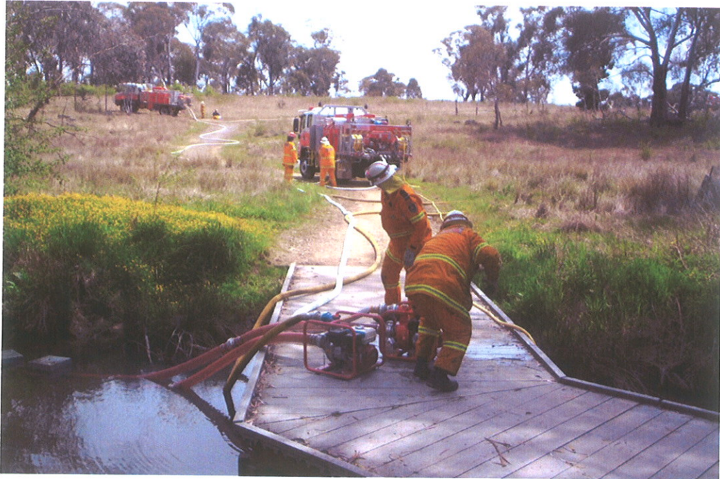
The Advanced Firefighter Assessment August 2011 at the rear of the FCC.

The most significant change to both staff and volunteers this year was the migration of all Fire Zone Applications into the SAP data base system. The migration has provided some challenges to all staff in understanding the capability of the SAP system. This year also found the RFS moving into Online learning systems with the Safety and Volunteer Inductions now being completed by new members over the internet through MyRFS. Region West is providing Online learning option through the Moodle network system for a number of courses including BF, BFG, BFS, CLG and upgrades of CLW and CLS. This system will be expanded next year to include other main stream and specialist courses that have a theory component that can be adapted to Online learning.