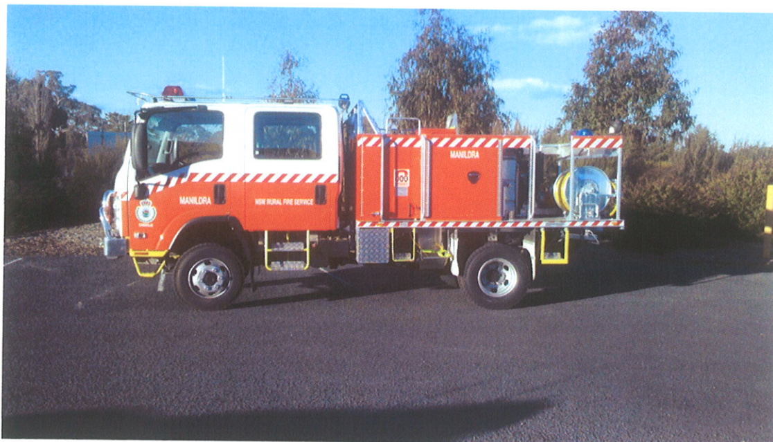
Three new NPS Isuzu Cat 7 Tankers delivered

“Where Risk Management is our Passion and Hazard Reduction is our Priority”