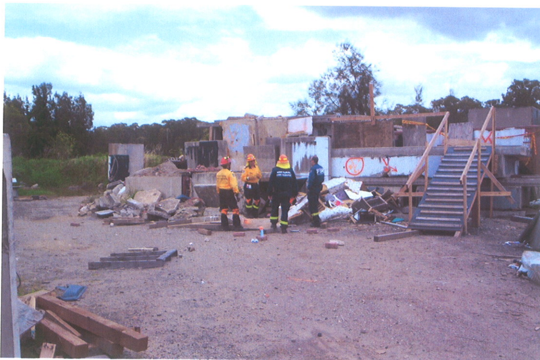
RFS members undertaking Urban Search and Rescue Training from FRNSW