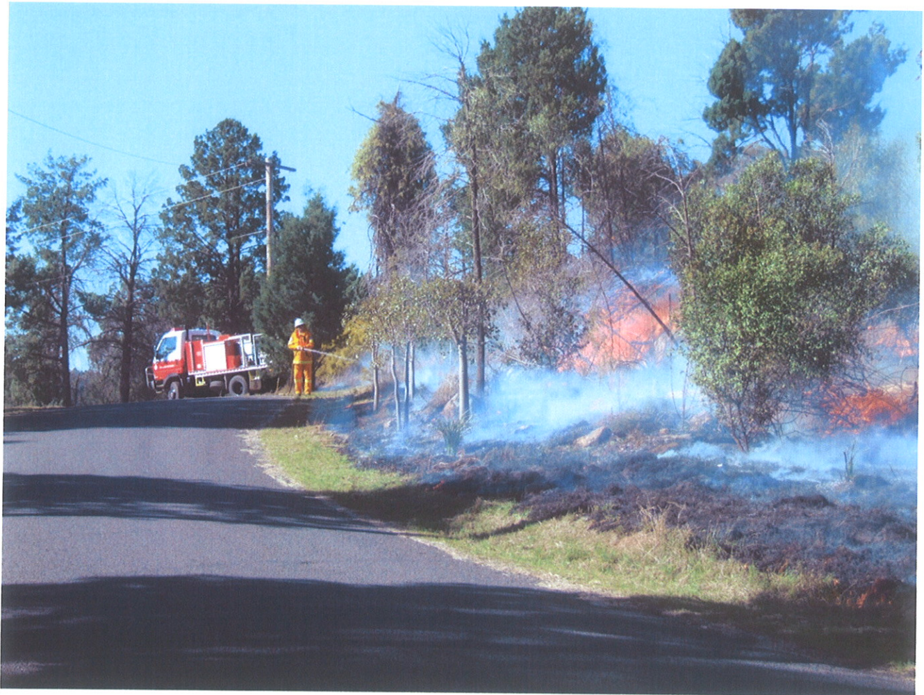
Volunteers conducting a HR Burn within the Eugowra Village

The State figures presented to the Bush Fire Coordinating Committee meeting on 26 th July 2012 indicate that Canobolas Zone has again completed the most hazard reduction in the State despite the wet year we have experienced.