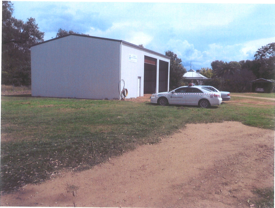
Eulimore Station as completed

“Where Risk Management is our Passion and Hazard Reduction is our Priority”