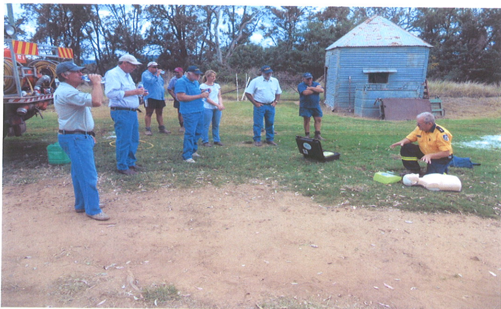
Eulimore members receiving instruction on the AED before their new Station opening

Training is still being taken out to the brigades as requested or held close to where the majority of the participants, on a particular course, reside.