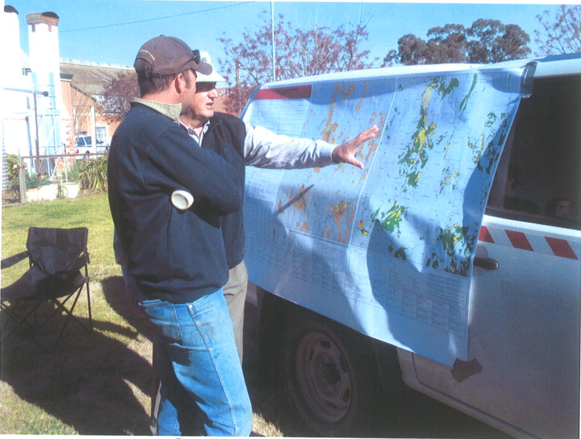
Gum Tree Meeting – Consultation in action