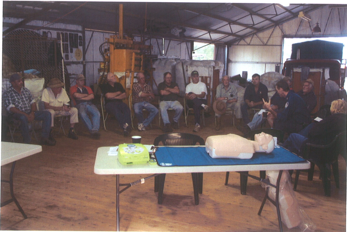
Trajere Gum Tree Meeting

“Where Risk Management is our Passion and Hazard Reduction is our Priority”