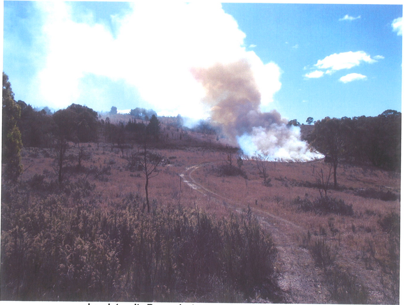
Low Intensity Burn private property near Ophir Road

“Where Risk Management is our Passion and Hazard Reduction is our Priority”