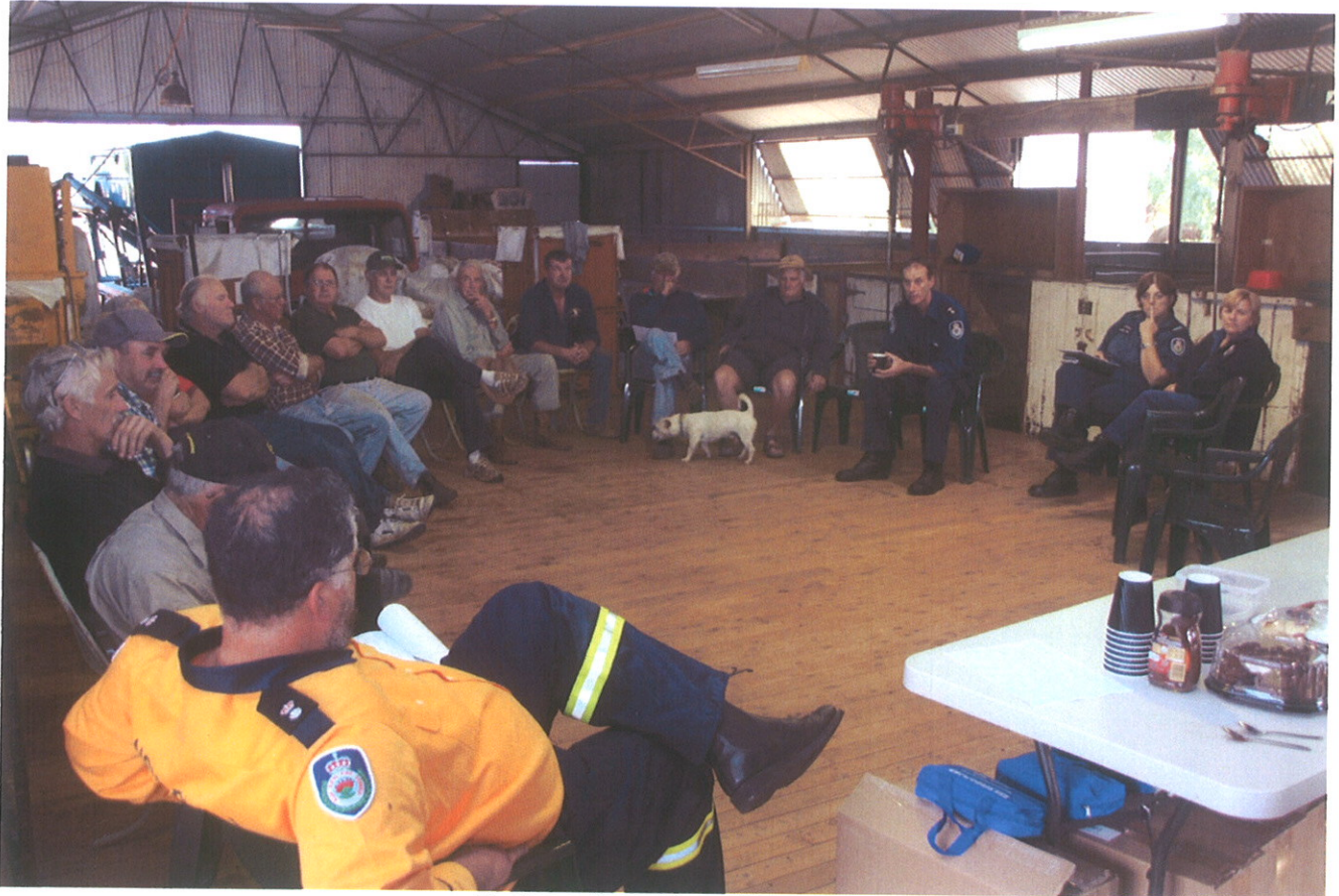
Trajere Gum Tree Meeting