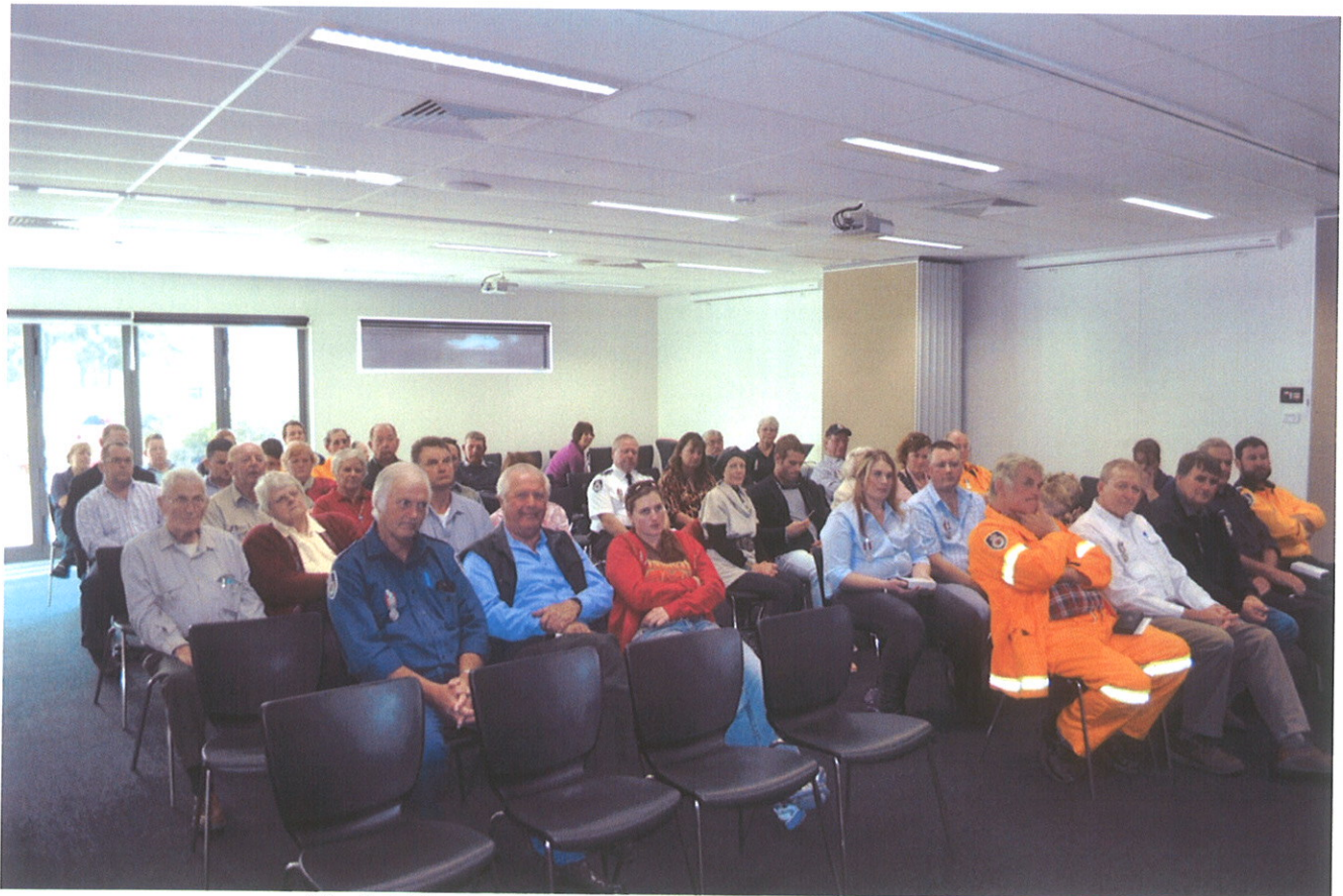
Medal Presentations at the Fire Control Centre