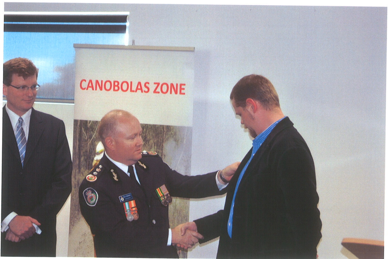
Medal Presentations to our Volunteers

"Where Risk Management is our Passion and Hazard Reduction is our Priority"