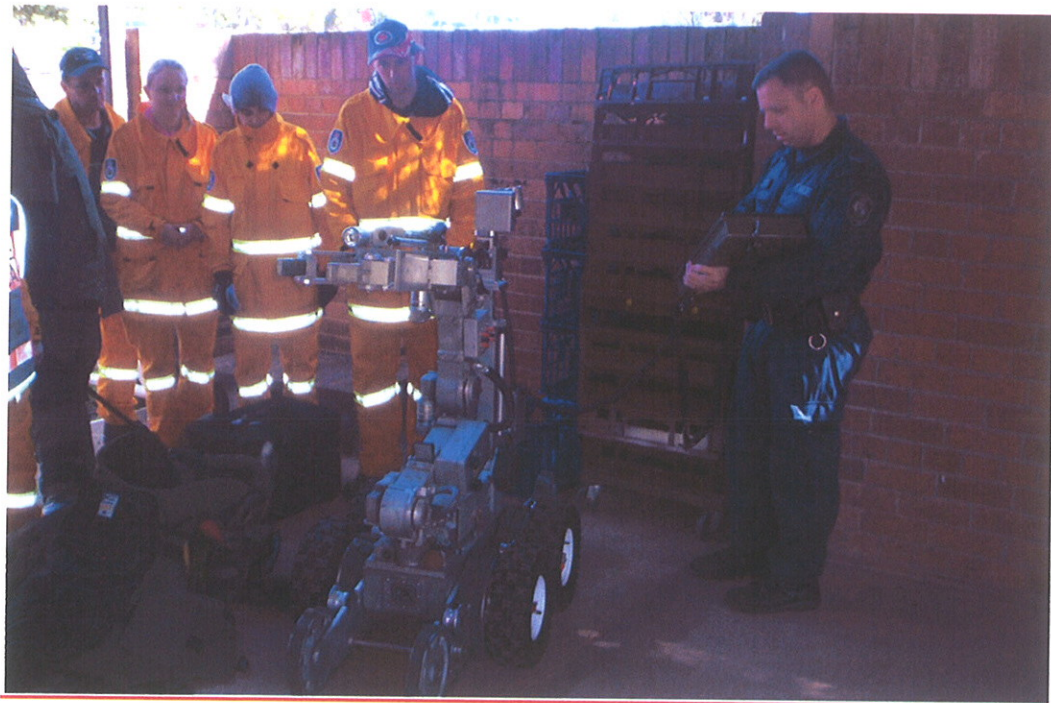
A crew learning about Anti-Terrorism at the Region West Exercise August 2011