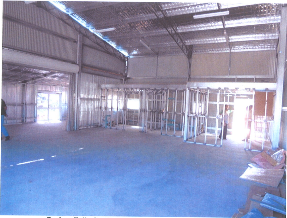
Darbys Falls Station under construction February 2012