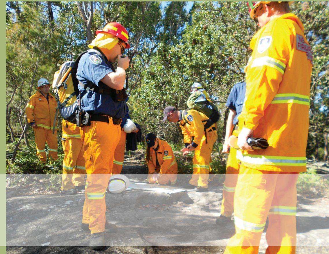
Exercise at Duffys Forest 2012.

The NSW Rural Fire Service has adopted the new National All Hazards mapping symbology.