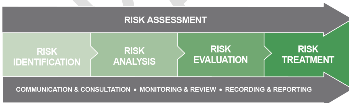
Figure 1: Overview of the risk assessment process

The Australia/New Zealand Standard AS/NZS 31000: 2018 Risk Management was used to guide the bush fire risk assessment process. This is outlined in Figure 1 below.