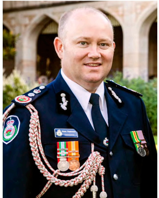
Commissioner Shane Fitzsimmons, AFSM

Deputy Commissioner Rogers represents the NSW RFS on several national and international bodies including the International Association of Fire Chiefs, International Asian Fire Chiefs, the Wildland Fire Policy Committee, National Bush Fire Arson Taskforce and a number of AFAC Groups.