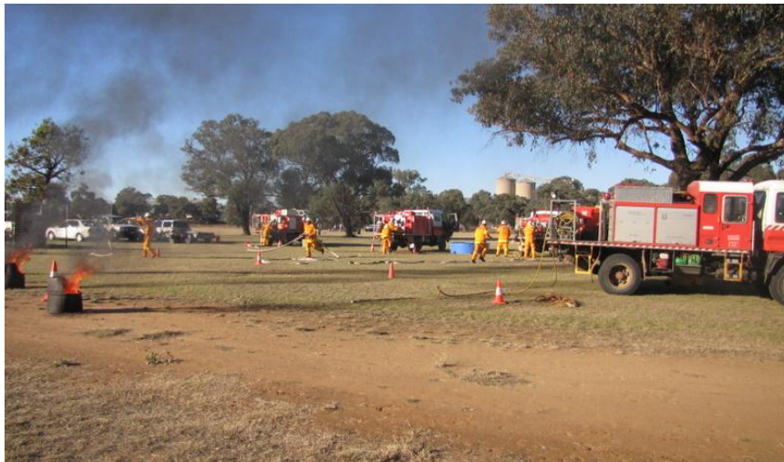
Yeoval, Washpen and Bournewood Brigades putting their training to good use at the 2011 Yeoval Show

Training is still being taken out to the brigades as requested or held close to where the majority of the participants, on a particular course, reside. The Orange Molong Road Brigade Station has also been utilised for training workshops one Saturday each month during winter with volunteers from all over the Canobolas Zone attending. The workshops have proved to be very popular with the Canobolas Zone volunteers and will recommence at the end of the fire season.