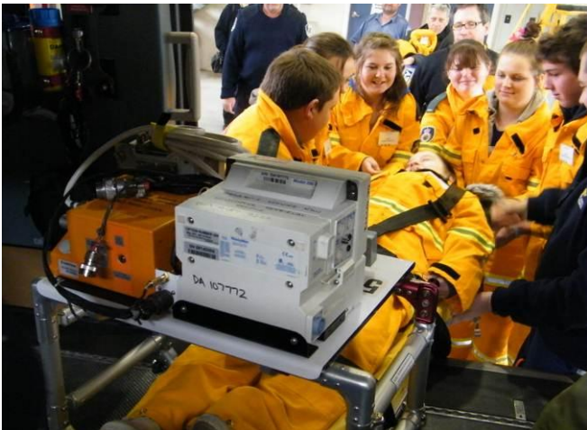
Cowra High School Cadets getting “hands on” experience during a visit to CHC Helicopters

The Programme is overseen by Canobolas Zone staff and the training is provided by several volunteer members for each school.