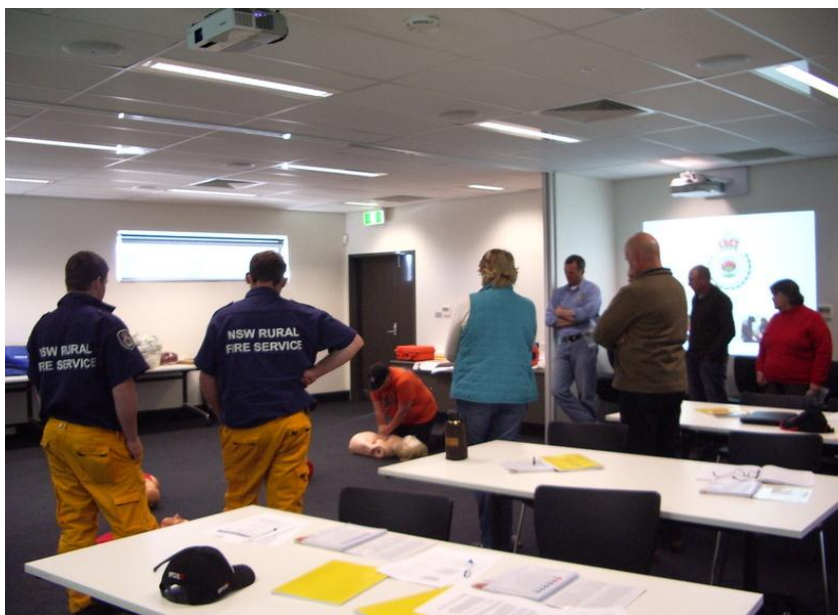
First Aid training at the Canobolas Zone Fire Control Centre

During this year's hazard reduction season we again took the opportunity to assess personnel in Prescribed Burning Supervisor. This was welcomed by the volunteers who took advantage of the opportunity.