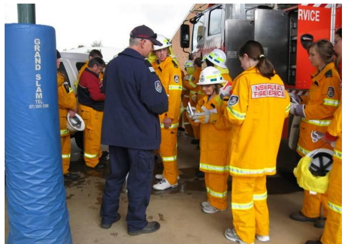
Tanker familiarisation at the Orange Christian School