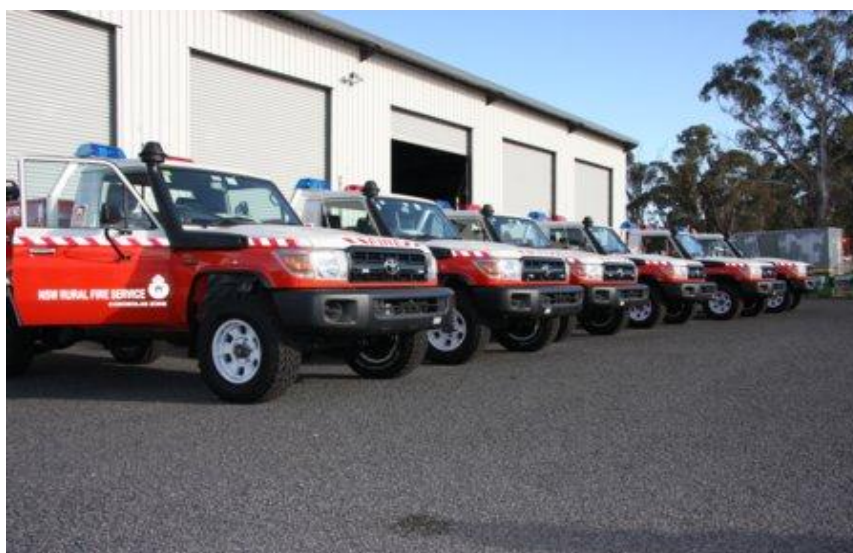
Six new Cat 9 Tankers as received by Canobolas Zone 2011