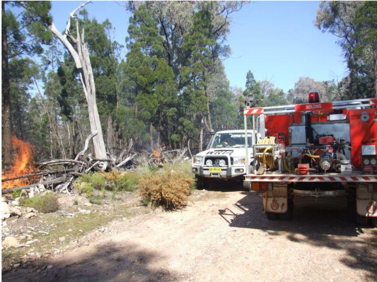
Volunteers/NPWS and Lachlan CMA traditional owners conducting a HR Burn