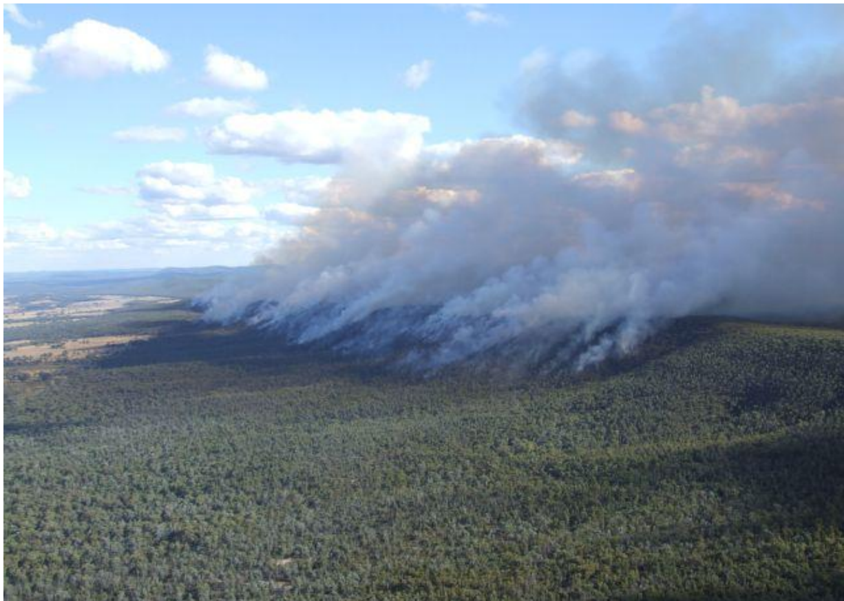
Low Intensity Burn Wanda Wandong area Goobang National Park “Where Risk Management is our Passion and Hazard Reduction is our Priority”