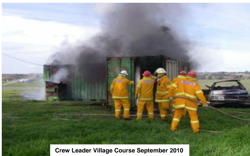
Crew Leader Village Course September 2010

“Where Risk Management is our Passion and Hazard Reduction is our Priority”