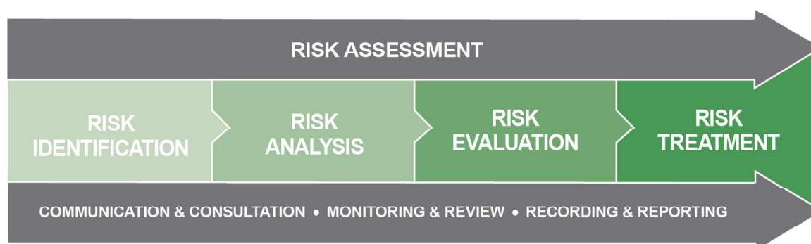
Figure 1: Overview of the risk assessment process

The Australia/New Zealand Standard AS/NZS 31000: 2018 Risk Management was used to guide the bush fire risk assessment process. This is outlined in Figure 1 below.