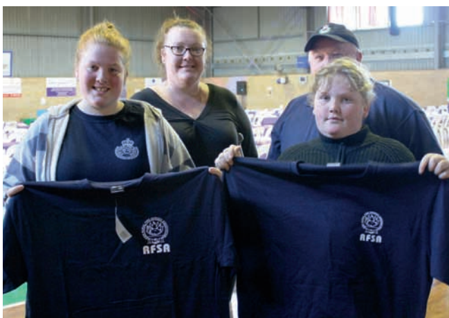
Two more blue t-shirts to add to the wardrobe. The Member Engagement stand updated the details & wardrobes of many members at the Volunteers' Family Day.