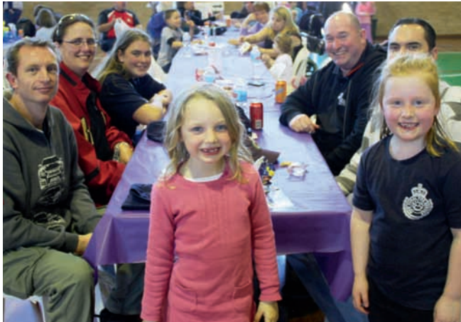
Some happy family faces at Cessnock, enjoying the Volunteers' Family Day.