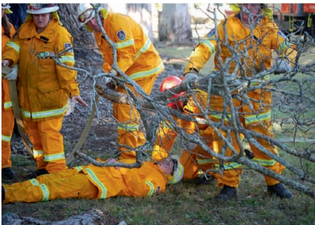
Crew members extricate an (exercise) injured victim of tree deadfall.