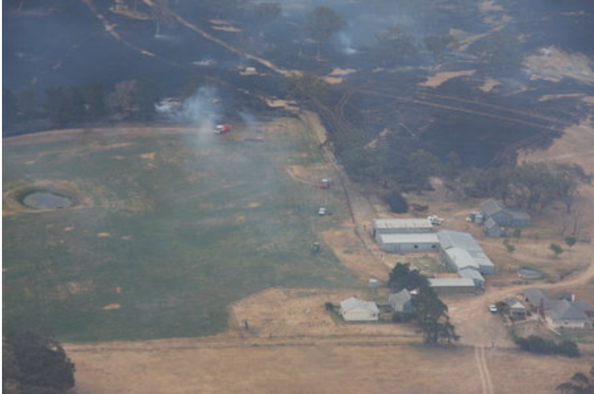
Winderera Fire - showing the impact of fire close to property