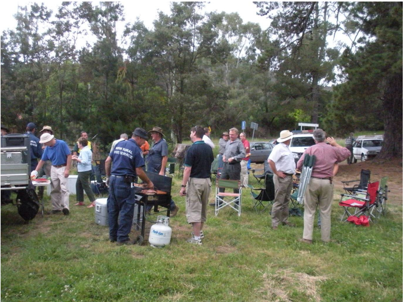
Gum Tree Meeting – November 2009 at John Williams Park Towac Valley

“Where Risk Management is our Passion and Hazard Reduction is our Priority”