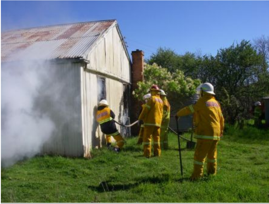
Canobolas Volunteers during training at Springside

The Zone is working towards meeting Service Standard 6.1.2 which provides details on the required qualifications for all levels of the organisation, volunteer or staff. Over the next year the focus will be on the Bush Firefighter (BF) qualification. One hundred and seventy Blayney Shire volunteer members were recognised through this BF RPL process this year.