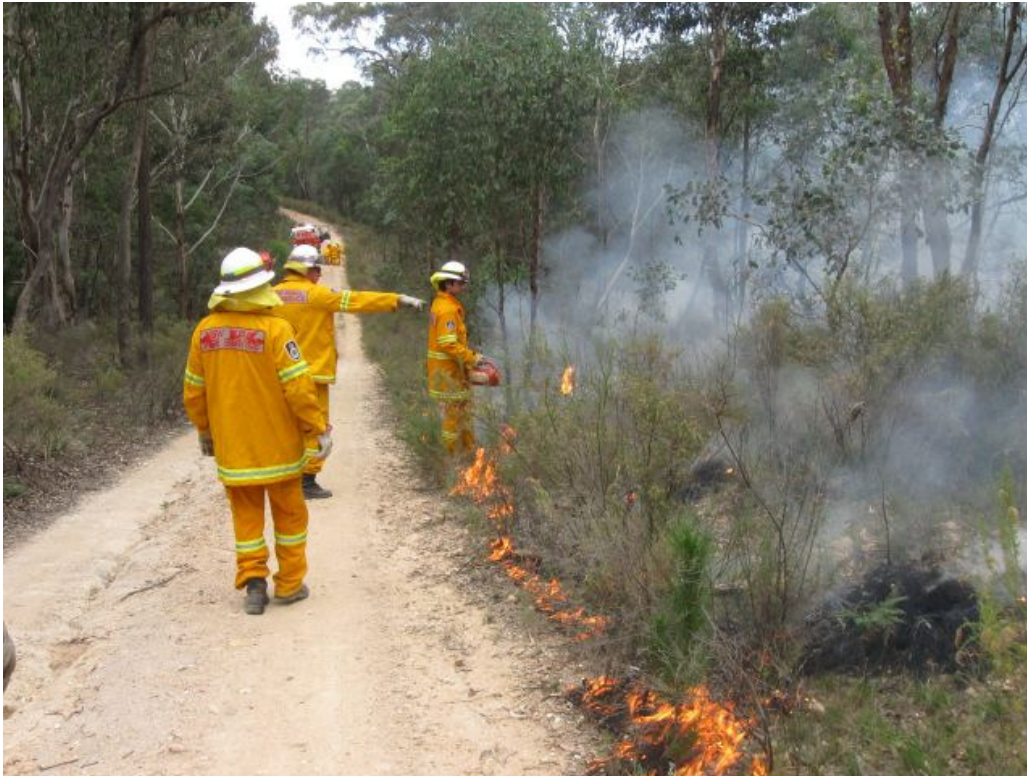
Volunteers conducting a 50ha HR Burn at MT Bulga in March 2010