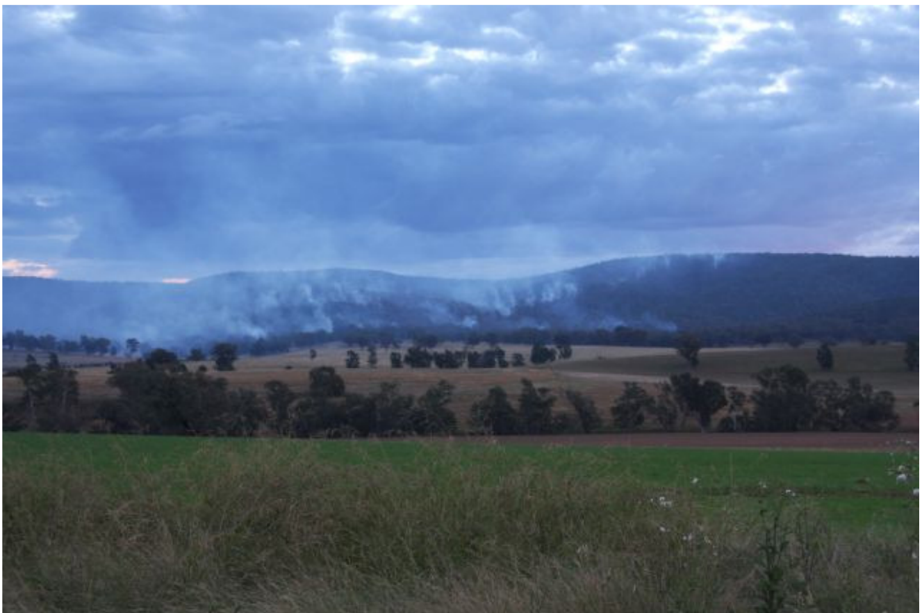
Low Intensity 700ha Burn near Mandagery April 2010

In terms of the 107 HR plans proposed to be actioned by the Bush Fire Management Committee's Agencies, 97 of these were completed successfully with just 10 unable to be completed due to adverse weather impacts