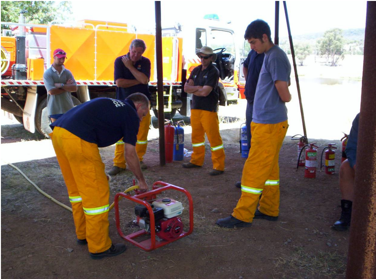
BF Training at Red Hill

This year we had no significant injuries to firefighters during training activities.