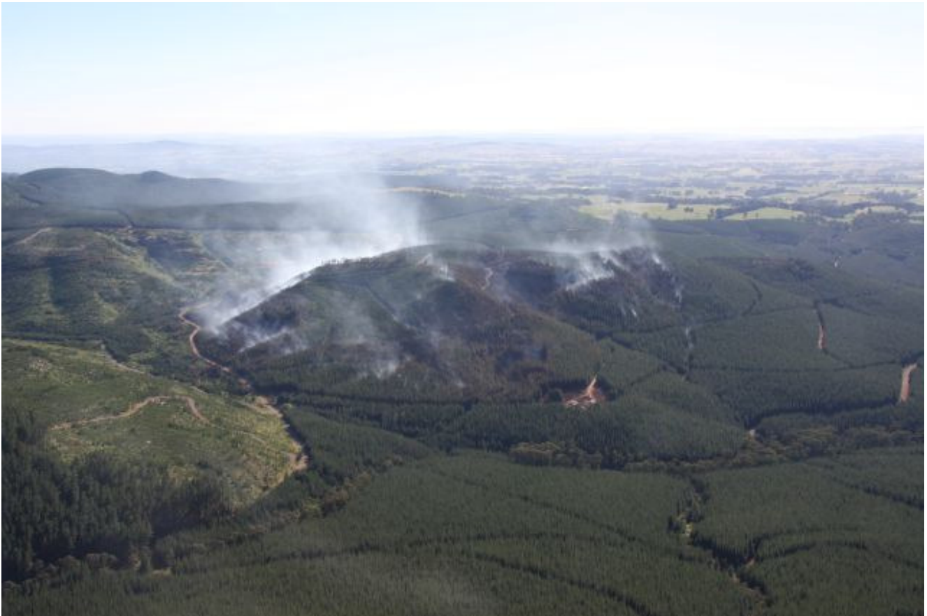
The “Old Sawmill” S44 Fire viewed from the South East - 2 days after ignition

November 15 saw the first major ignition of the season, the “Old Sawmill” fire in the Canobolas State Forest south of Mt Canobolas, this fire was declared as a Section 44 Emergency and kept the firefighters of the RFS, Forest NSW and National Parks and Wildlife Service busy for 8 days. Fortunately, with support from our Councils, contractors and the Aviation Support the pine plantation fire was contained to just under 63ha and no losses were suffered on private lands.