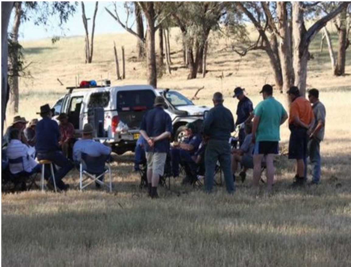
Gum Tree Meeting – November 2009 - Larras Lee Airstrip

These meetings identified many opportunities for hazard reduction on private land as well as on Forest NSW and NPWS tenure.