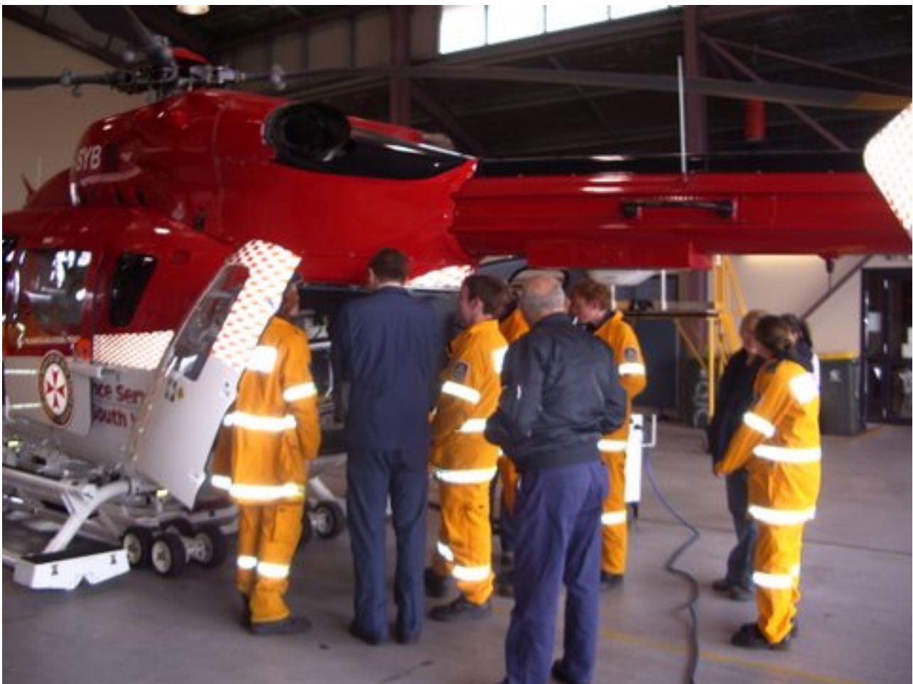
Canobolas Cadets visiting Careflight

During 2009/2010, a group of 10 students from Blayney High School participated in the programme with 4 students joining local Blayney brigades. 13 students from Canowindra High School and 22 students from Cowra High School also participated in the programme with 10 students joining local Cowra Brigades.