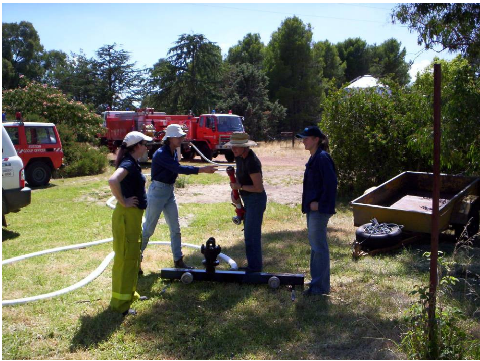
Training our female members at Red Hill

Training is still being taken out to the brigades as requested or held close to where the majority of the participants, on a particular course, reside.